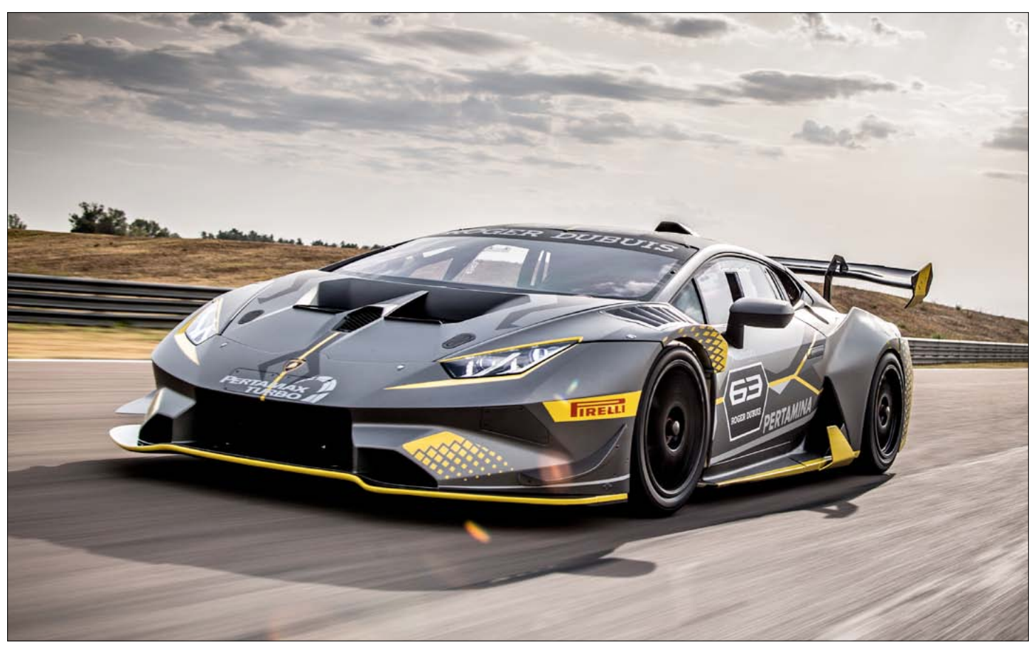
Lamborghini Huracán Super Trofeo EVO