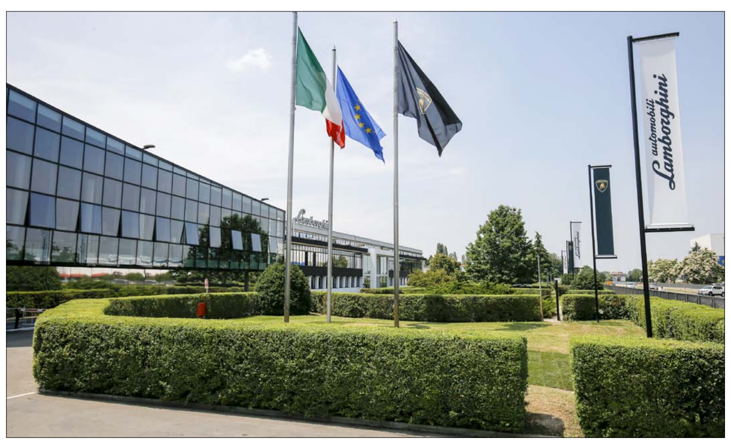
Lamborghini Headquarters, Sant'Agata, Italy.