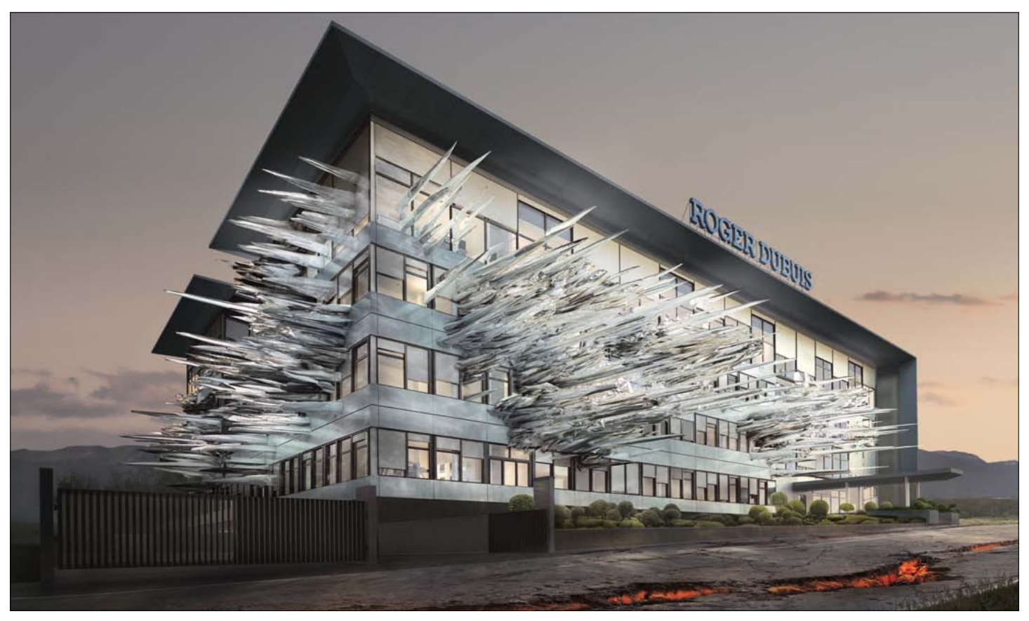
Manufacture Roger Dubuis, Geneva, Switzerland.