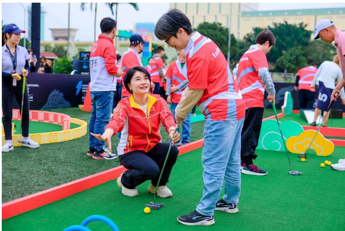
World Champion and Olympic Silver Medalist in Gymnastics Mo Huilan interacted with MSO athletes