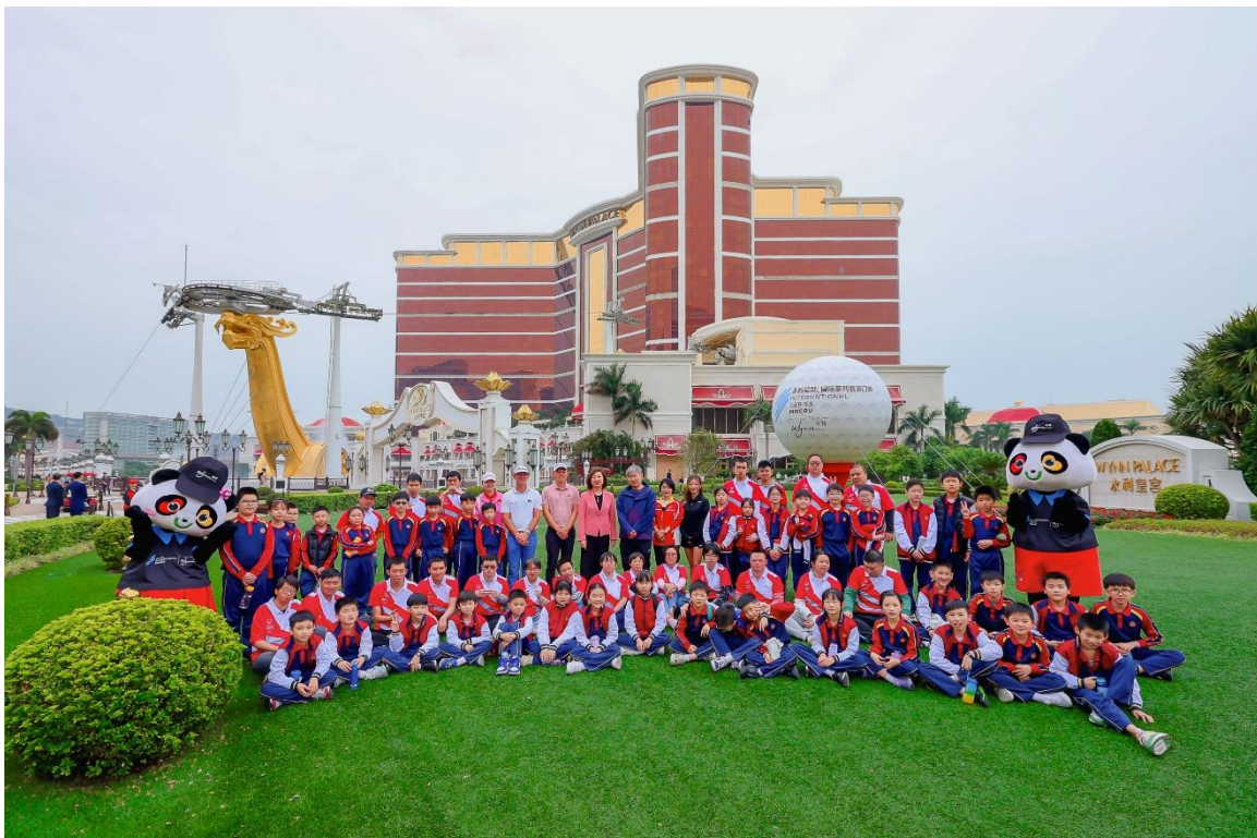
Asian Tour stars coached MSO athletes at Wynn Palace