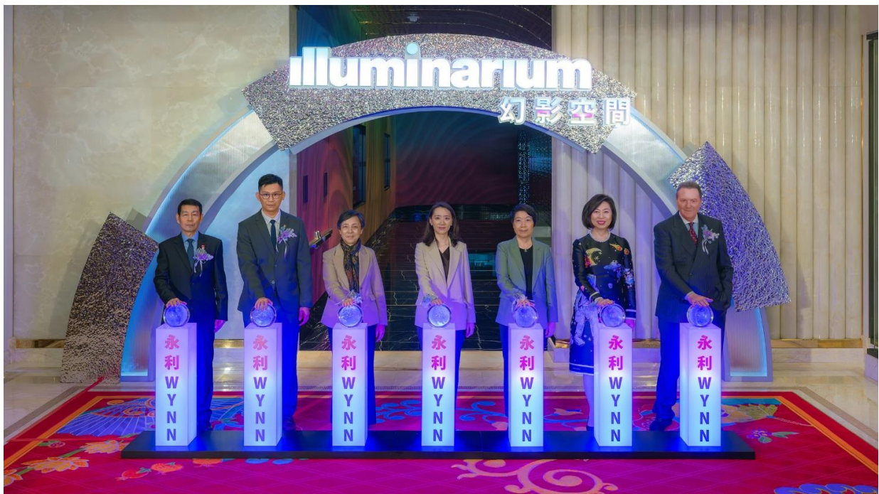
Distinguished guests attend the launch of the new Illuminarium at Wynn