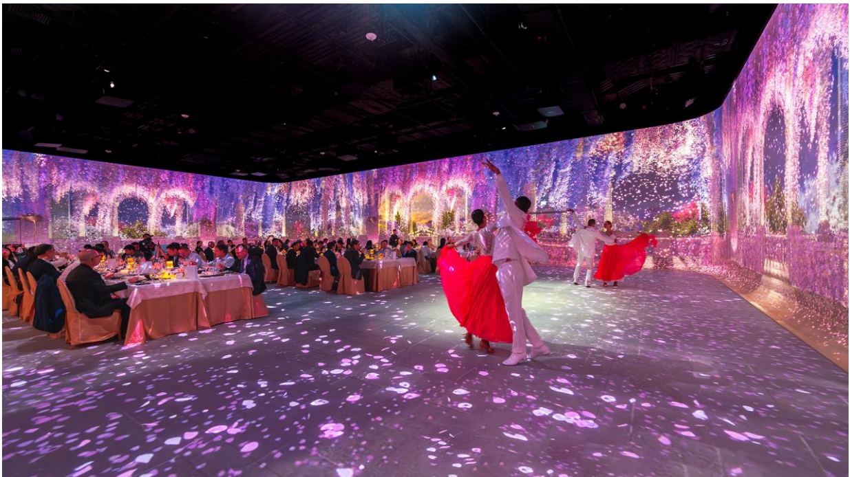
Guests attend the Illuminarium immersive gala dinner at Wynn