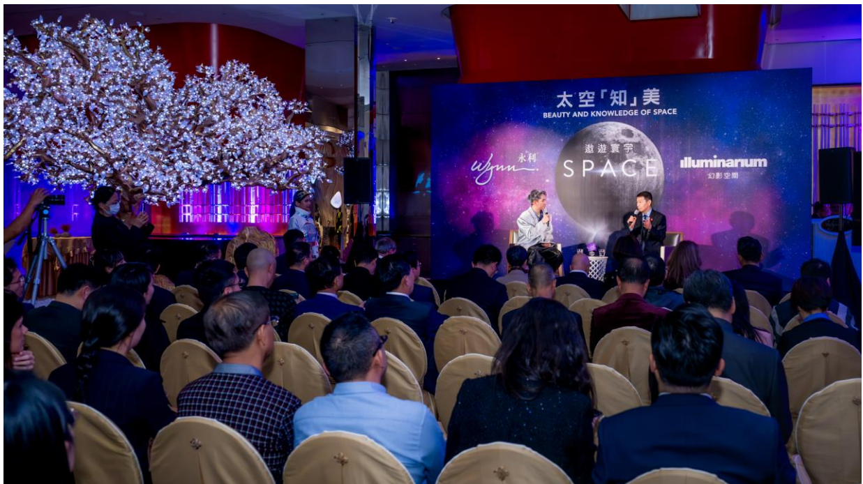
Wynn hosts a "Beauty and Knowledge of Space" sharing session