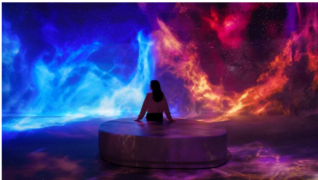
Illuminarium features dazzling and colorful scenes, taking visitors on a journey across the galaxy