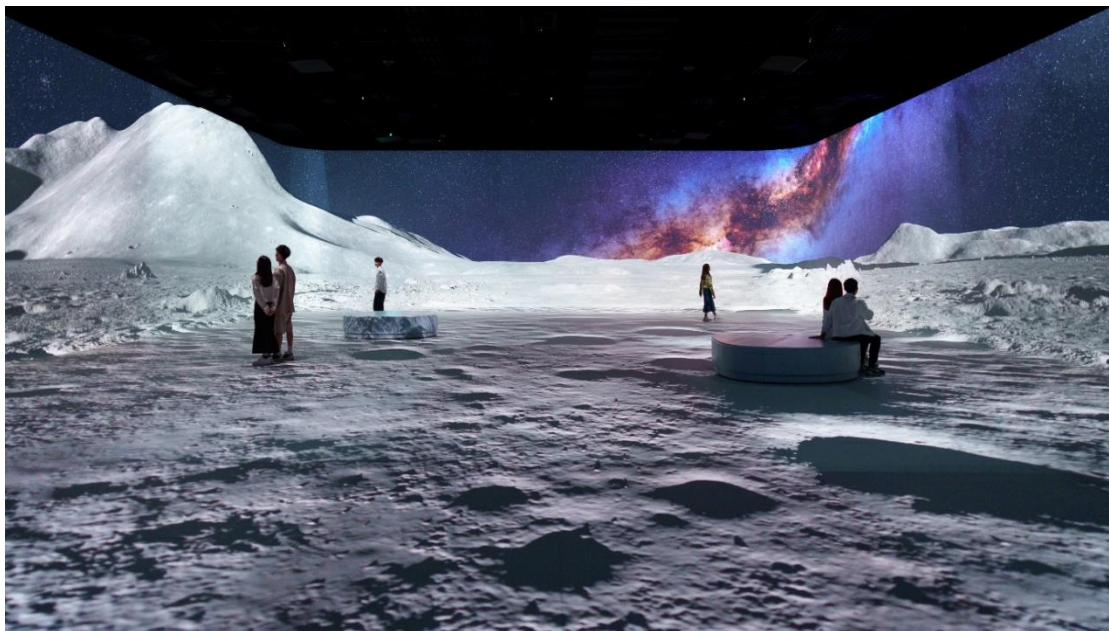
Visitors can explore the universe from 360-degree angles in the Illuminarium