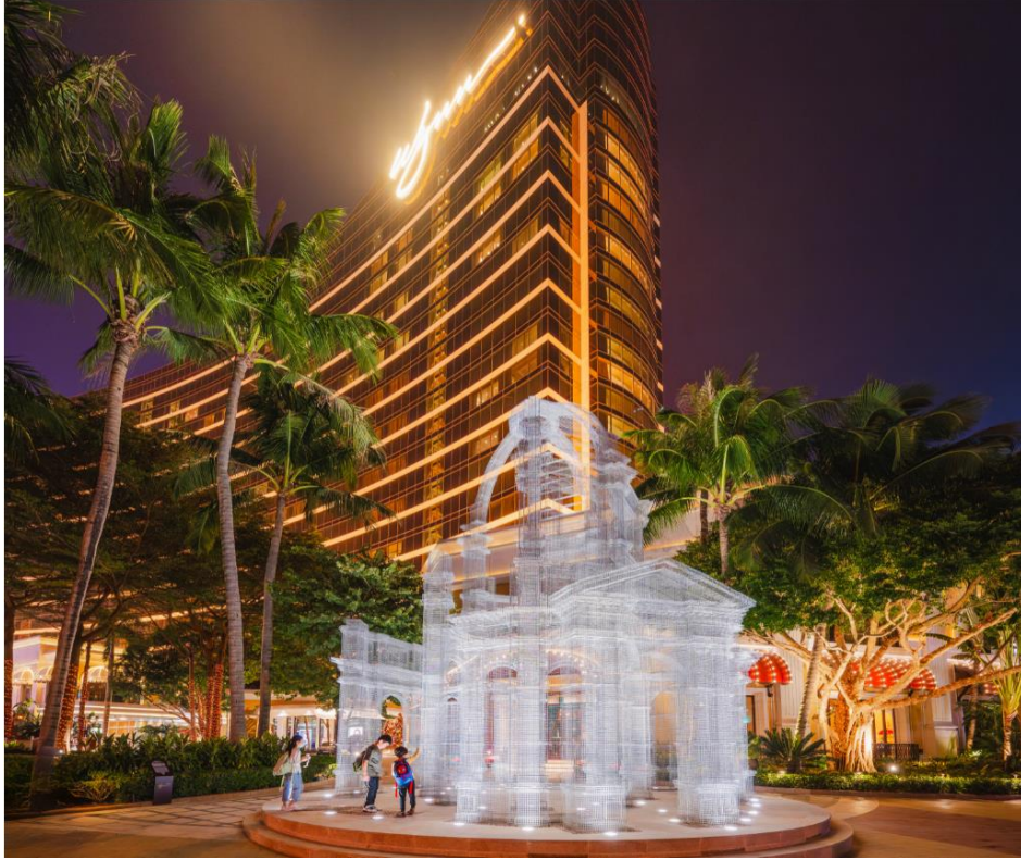
Etherea – one of Edoardo Tresoldi's most evocative works