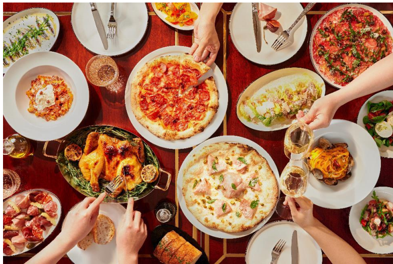
Authentic Italian cuisine served at Lakeside Trattoria