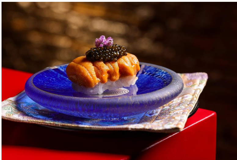
Premium sushi from Mizumi's Sushi Omakase Menu