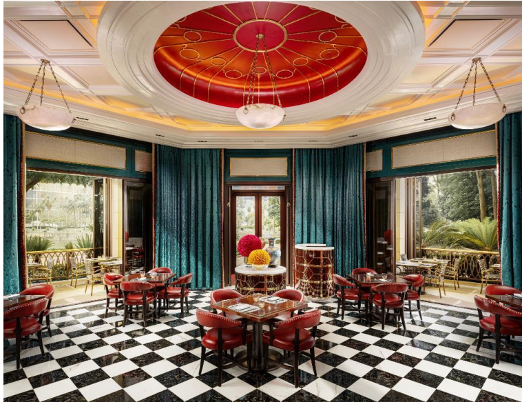
Lakeside Trattoria – the casual Italian restaurant in Wynn Macau