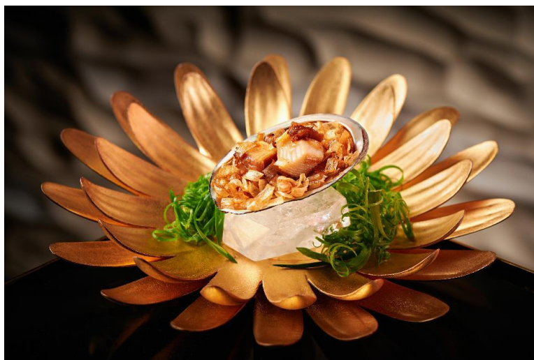
Signature dishes from Golden Flower's new a la carte menu: Slow Cooked Abalone with Crispy Scallion