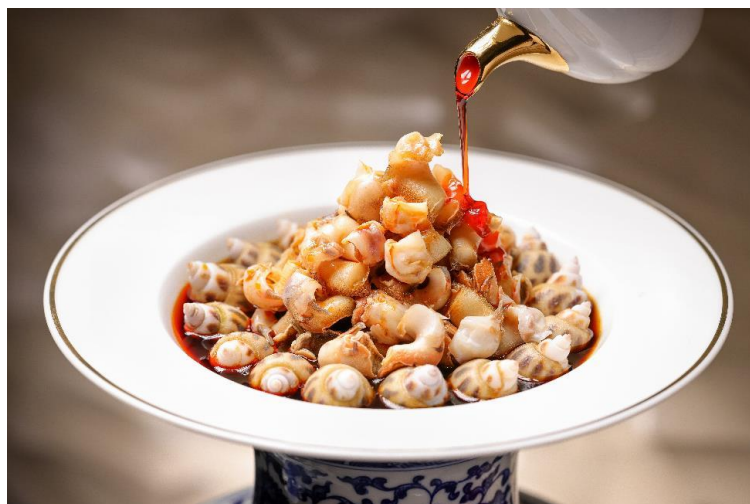
Marinated Sea Snails with Chili Sauce