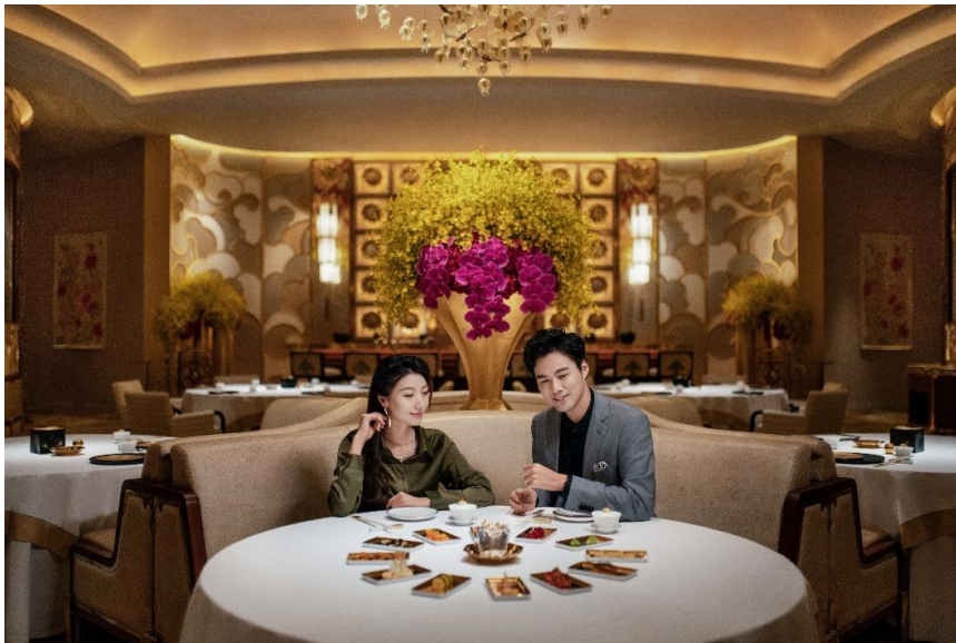
Photo 1: Wynn’s Acclaimed Signature Restaurants Proudly Present “Dine Like A Pro at Wynn”