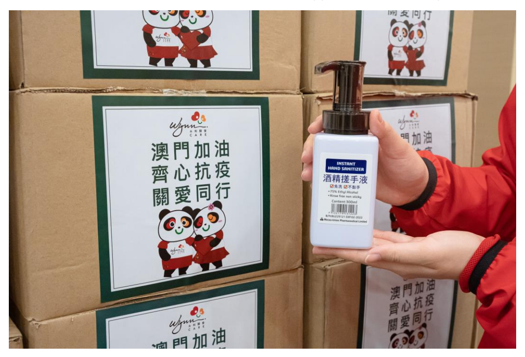
These supplies are expected to reach members of the Macao Chamber of Commerce and local SMEs in stages, benefiting over 13,000 SMEs.

Wynn donates anti-epidemic supplies worth MOP 2 million to local SMEs, joining hands with the Macao Chamber of Commerce to distribute the supplies to local enterprises in need.