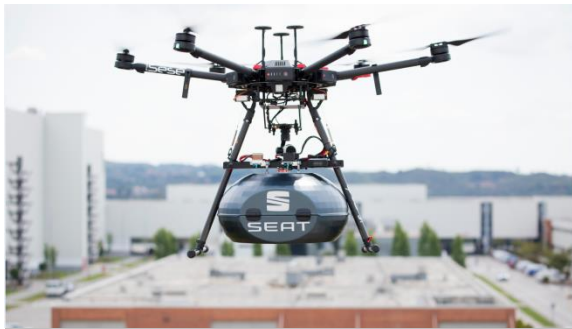
The drone connects the Sesé and SEAT plants in 15 minutes

The addition of drones will improve flexibility on the production lines by connecting the just over two kilometre distance that separates both facilities for just in time fast deliveries in only 15 minutes, a process which is currently done by truck and takes 90 minutes. With this move, every time a part is needed on the production line, delivery will be made quickly, thus improving efficiency.