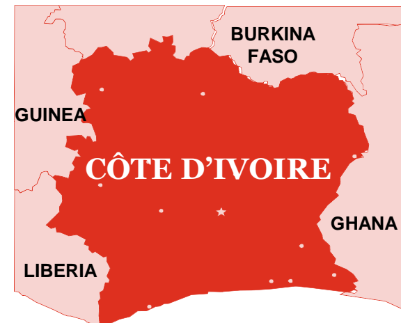
Cocoa Production in 2012 (Metric Tons)