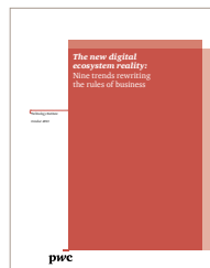
The new digital ecosystem: Nine trends rewriting the rules of business www.pwc.com/us/en/technology/publications/new-digital-ecosystem.jhtml