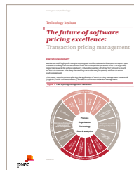
The future of software pricing excellence series www.pwc.com/softwarepricing