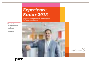
Experience radar 2013: Lessons from the US enterprise software industry www.pwc.com/us/en/advisory/customer-impact/publications/lessons-from-the-u.s.-enterprise-software-industry.jhtml