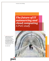
The future of IT outsourcing and cloud computing www.pwc.com/itocloudstudy