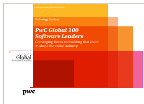
Global 100 Software Leaders – 2013 Report www.pwc.com/globalsoftware100

For more information about PwC research on software industry operational challenges and best practices, please visit the following web pages: