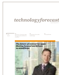
Technology Forecast – The future of enterprise apps: Moving beyond workflows to mindflows www.pwc.com/techforecast