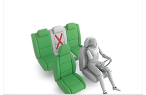
Britax Römer Duo Plus (ISOFIX)