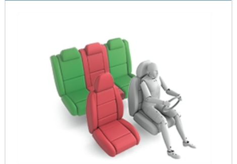
Römer King II LS (Belt)