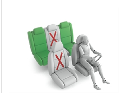
Maxi Cosi Cabriofix & EasyBase2 (Belt)