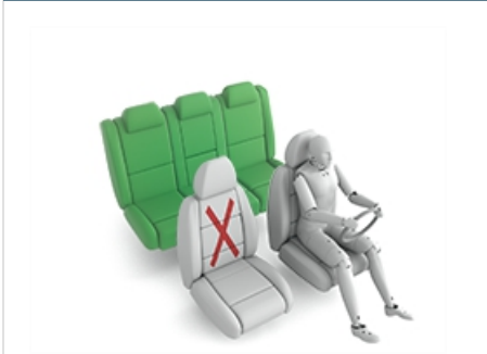
Maxi Cosi Cabriofix (Belt)