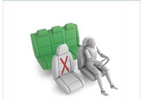
Römer King II LS (Belt)