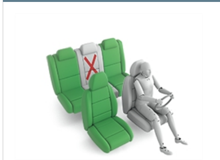
Maxi Cosi Cabriofix & EasyBase2 (Belt)