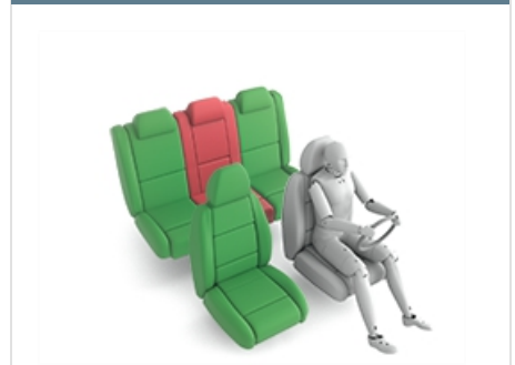
Römer King II LS (Belt)