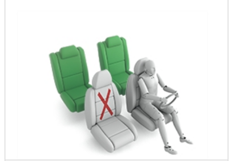
Römer Duo Plus (ISOFIX)