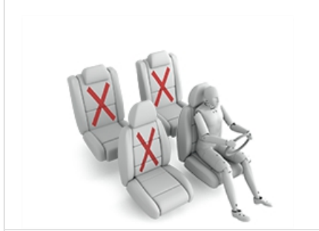
BeSafe iZi Kid X4 ISOfix (ISOFIX)