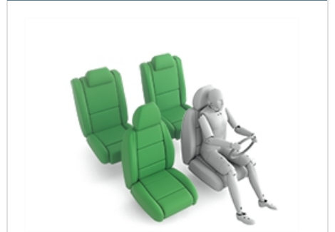
Römer King II LS (Belt)