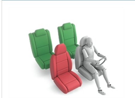
Maxi Cosi Cabriofix & EasyBase2 (Belt)