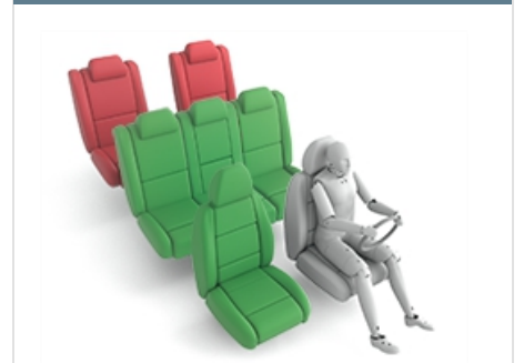
Römer King II LS (Belt)