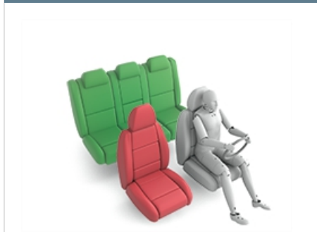
Maxi Cosi Cabriofix & EasyBase2 (Belt)