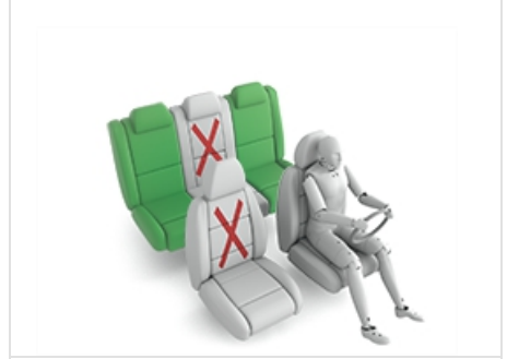
Römer Duo Plus (ISOFIX)