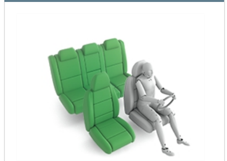
Römer King II LS (Belt)