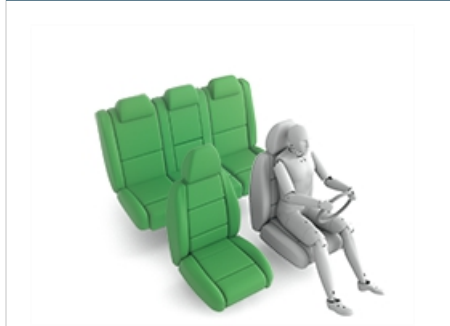
Maxi Cosi Cabriofix & EasyBase2 (Belt)