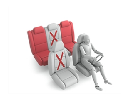
BeSafe iZi Kid X3 ISOFix (ISOFIX)