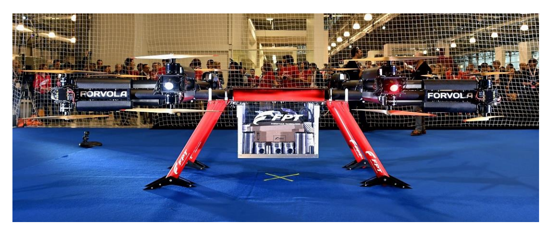
Watch the Forvola record video on the FPT Youtube Channel - <u>https://www.youtube.com/watch?v=sKZWZp8iX7M&t=1s</u>

Forvola's drone is the world's first customizable megadrone currently on the market. It has a power of 10 to 20 kW, can carry weights up to some 200 kg and fly for 30 minutes or more, depending on the payload.