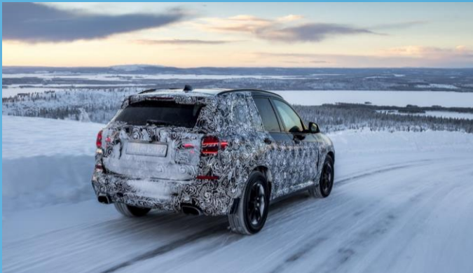
UltraGrip Ice Arctic SUV