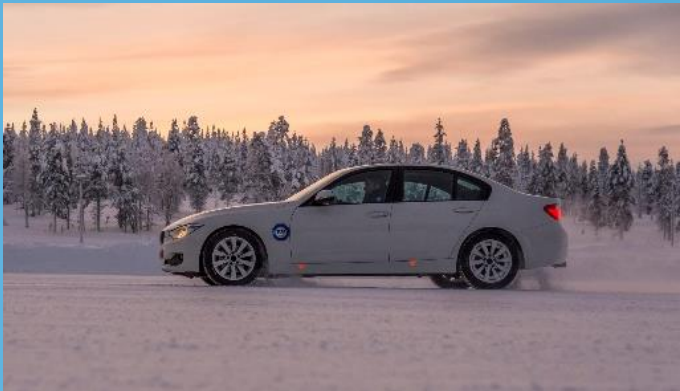
UltraGrip ICE 2