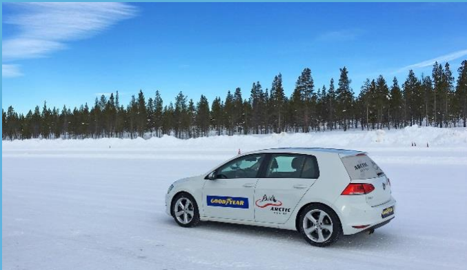
UltraGrip ICE Arctic