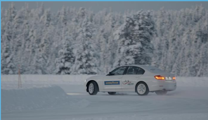
UltraGrip Ice 2