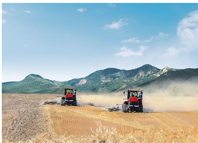
Caption: Supervised autonomy, one of the five categories of automation as defined by Case IH, allows an operator in one tractor to supervise the operation of a tractor in the same field without an operator.

The five categories defined by Case IH start with automating specific tasks on a piece of equipment. Case IH led the way by first providing producers automation technology in the 1990’s with AFS AccuGuide™ autoguidance, and it continues today with more advanced solutions, such as AFS AccuTurn™ automated headland turning technology and AFS Soil Command™ seedbed sensing technology.