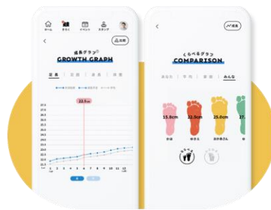
Screen images of foot growth projection and comparison that builds ties between parent and child

Patent pending (JAPAN) for determination of end of children’s foot length based on age, ball girth rate, and other information.