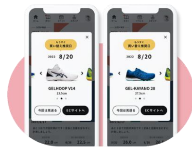
Screen images of recommending appropriate shoes