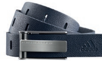
HOOK BELT | BR9025