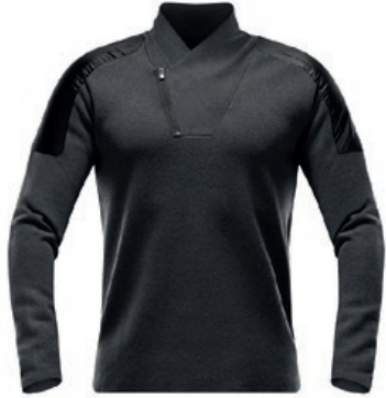
HIGH COLLAR KNIT TOP | BR9406