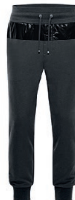
SWEAT PANTS | BR9355