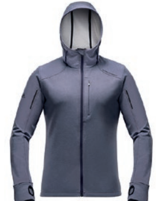
TRAINING HOODIE | BQ5377