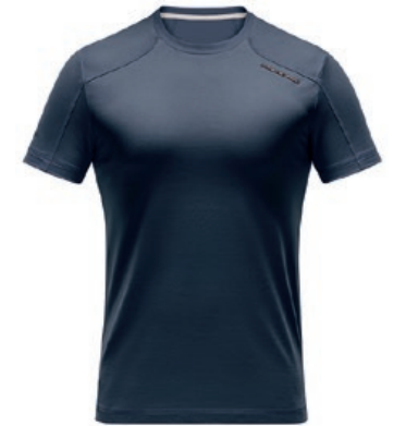
CORE TEE | BQ9741