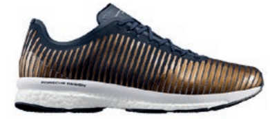
ENDURANCE 2.0 | S81194