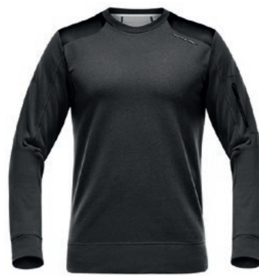
CREW SWEAT TOP | BR9368