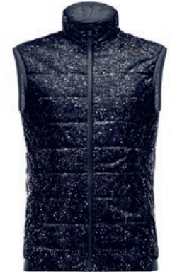
PADDED REFLECTIVE VEST | BR9428