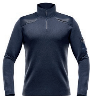
KNIT JUMPER | BR9348