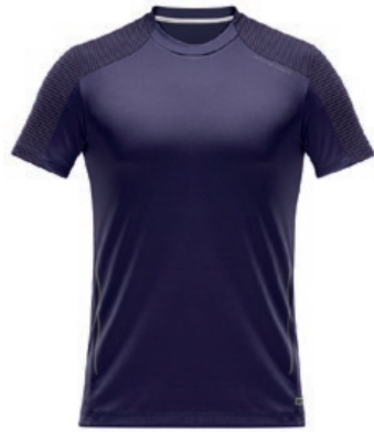
BS TEE | BR9373