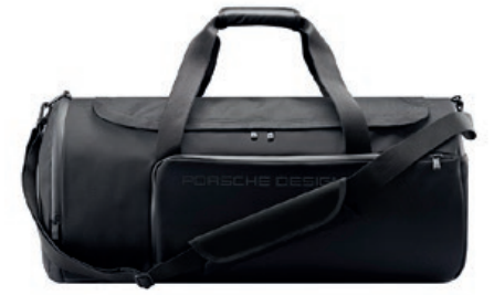
PDS ATHLETIC TEAMBAG | BR9032