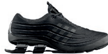
BOUNCE™:S⁴ | S81196