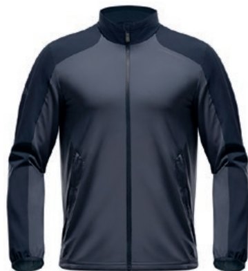
TRAINING JACKET | BQ9711