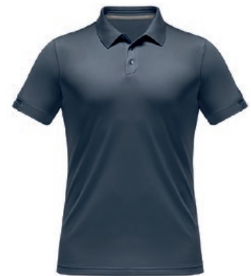
PIQUE POLO SHIRT | BQ5383