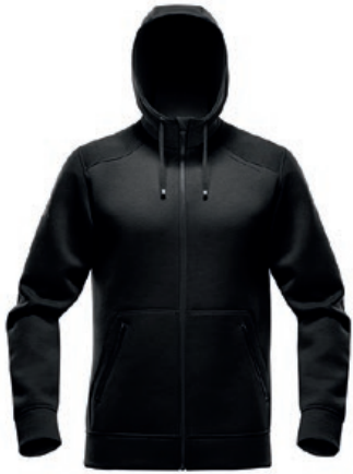
HEAVYWEIGHT HOODIE | BQ9764