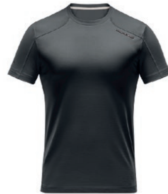
CORE TEE | BQ9737