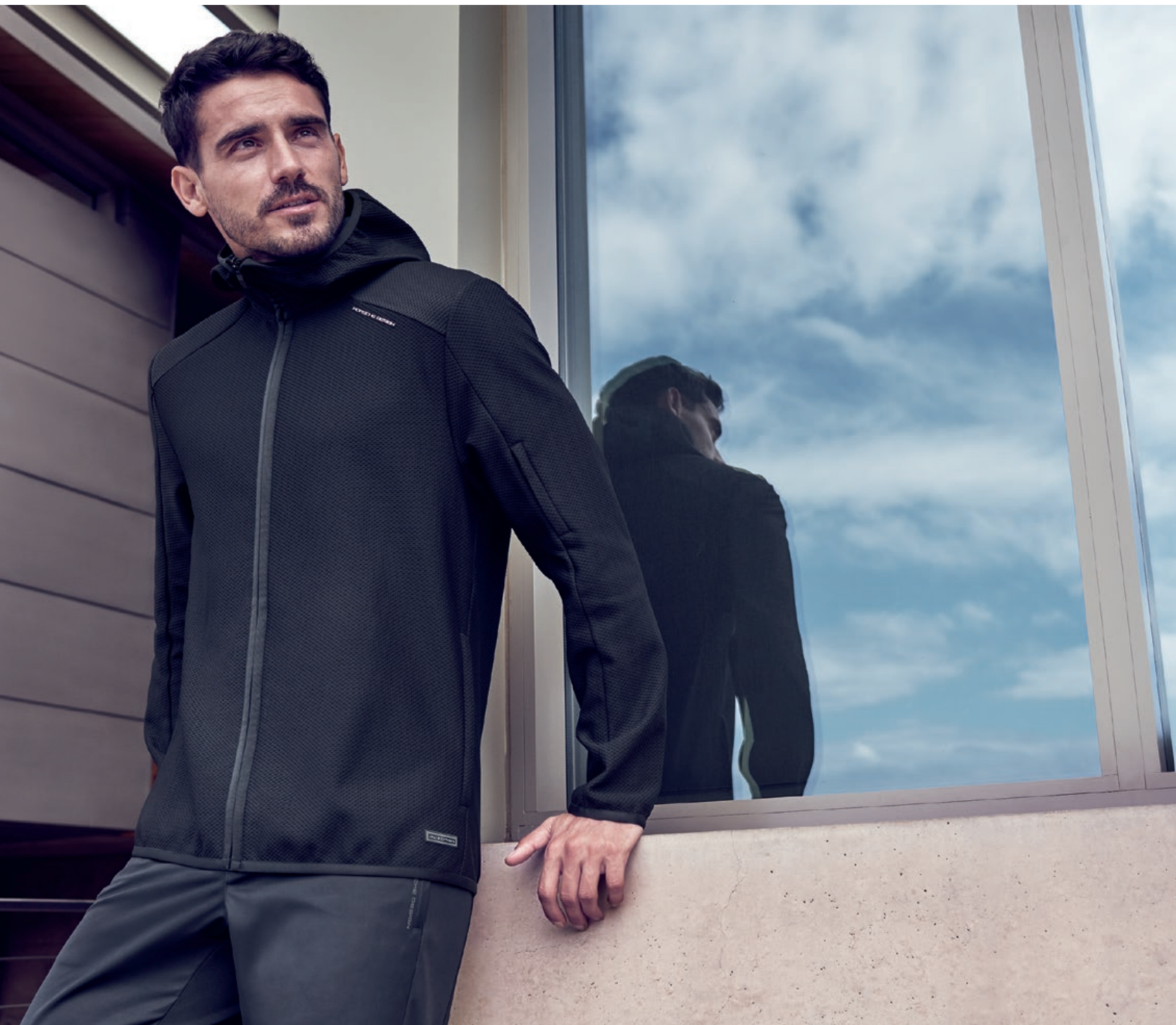
KNITSHELL JACKET 3.0 BS PANTS