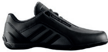
ATHLETIC MESH 3 | BB5521