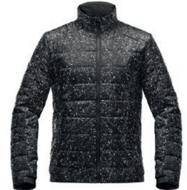
PADDED REFLECTIVE JACKET | BR9433