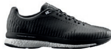
ENDURANCE 2.0 LEATHER | BB5533