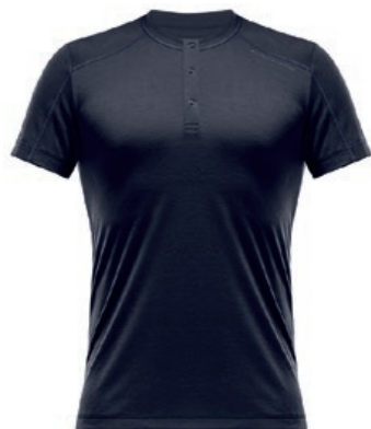
TECH WOOL TEE | BR9416