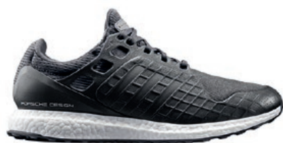
ULTRABOOST TRAINER | S81204