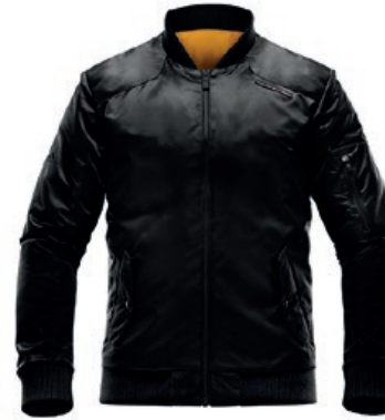
BOMBER JACKET | BR9450