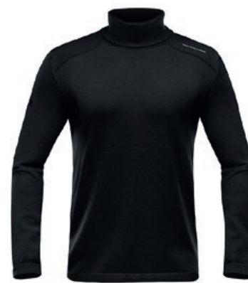
CLASSY ROLLNECK | BR9402