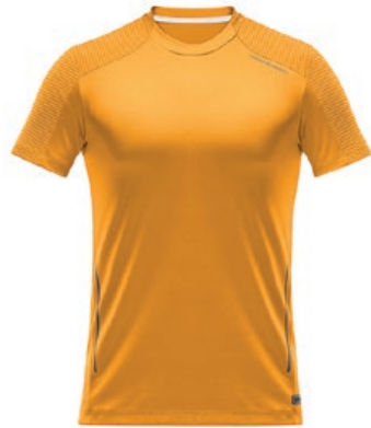
BS TEE | BR9376