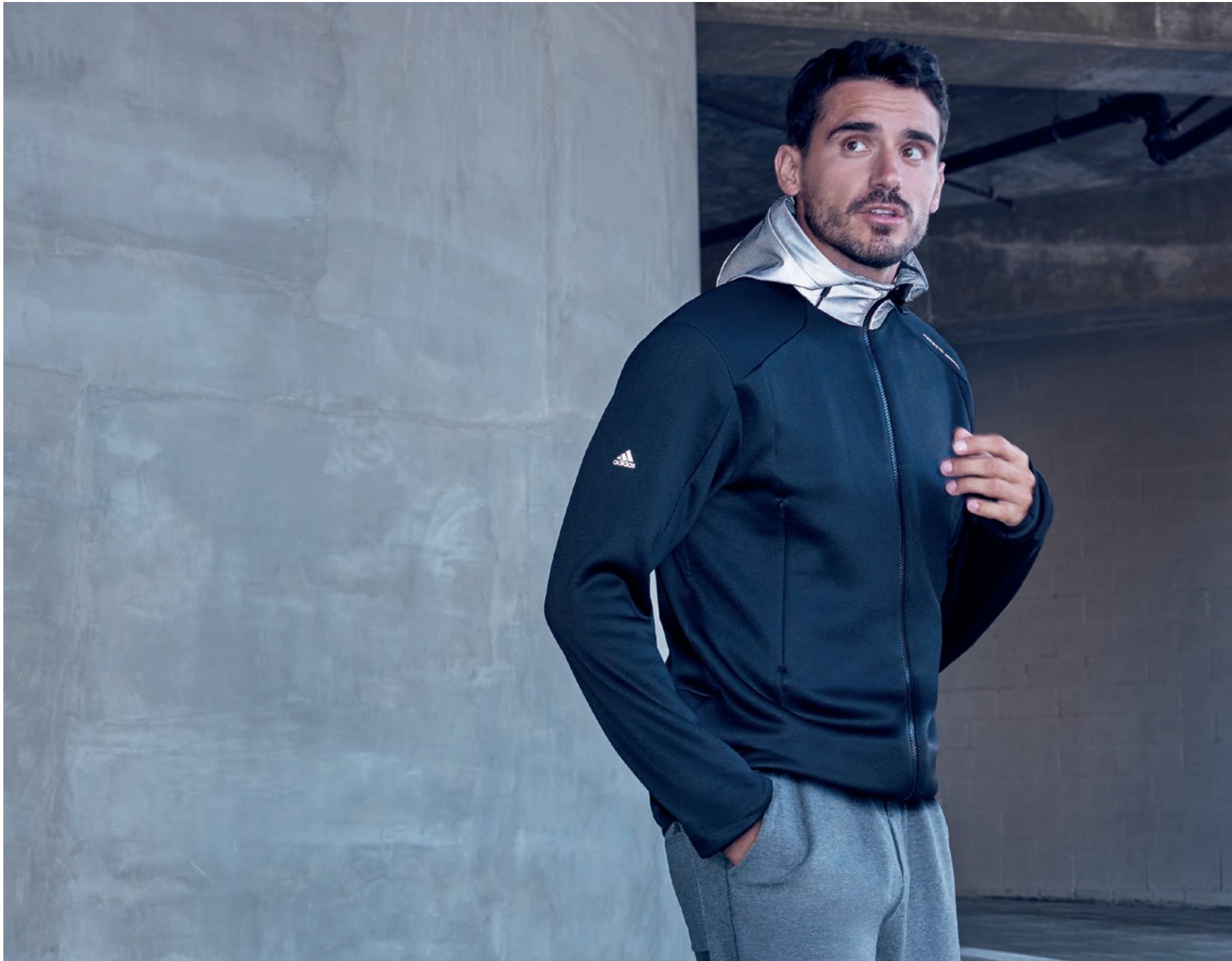
REFLECTIVE HOODIE BQ5373 SWEAT PANTS BR9355