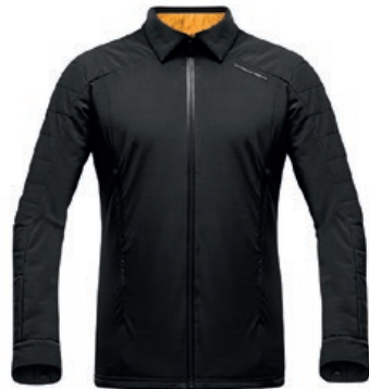
PADDED COMMUTER JACKET | BR9419