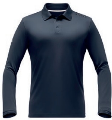
LS PIQUE POLO | BQ5391