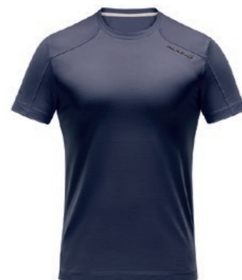
CORE TEE | BQ9742