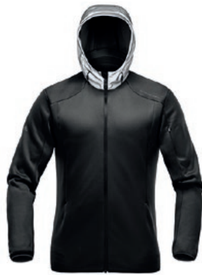
REFLECTIVE HOODIE | BQ5373