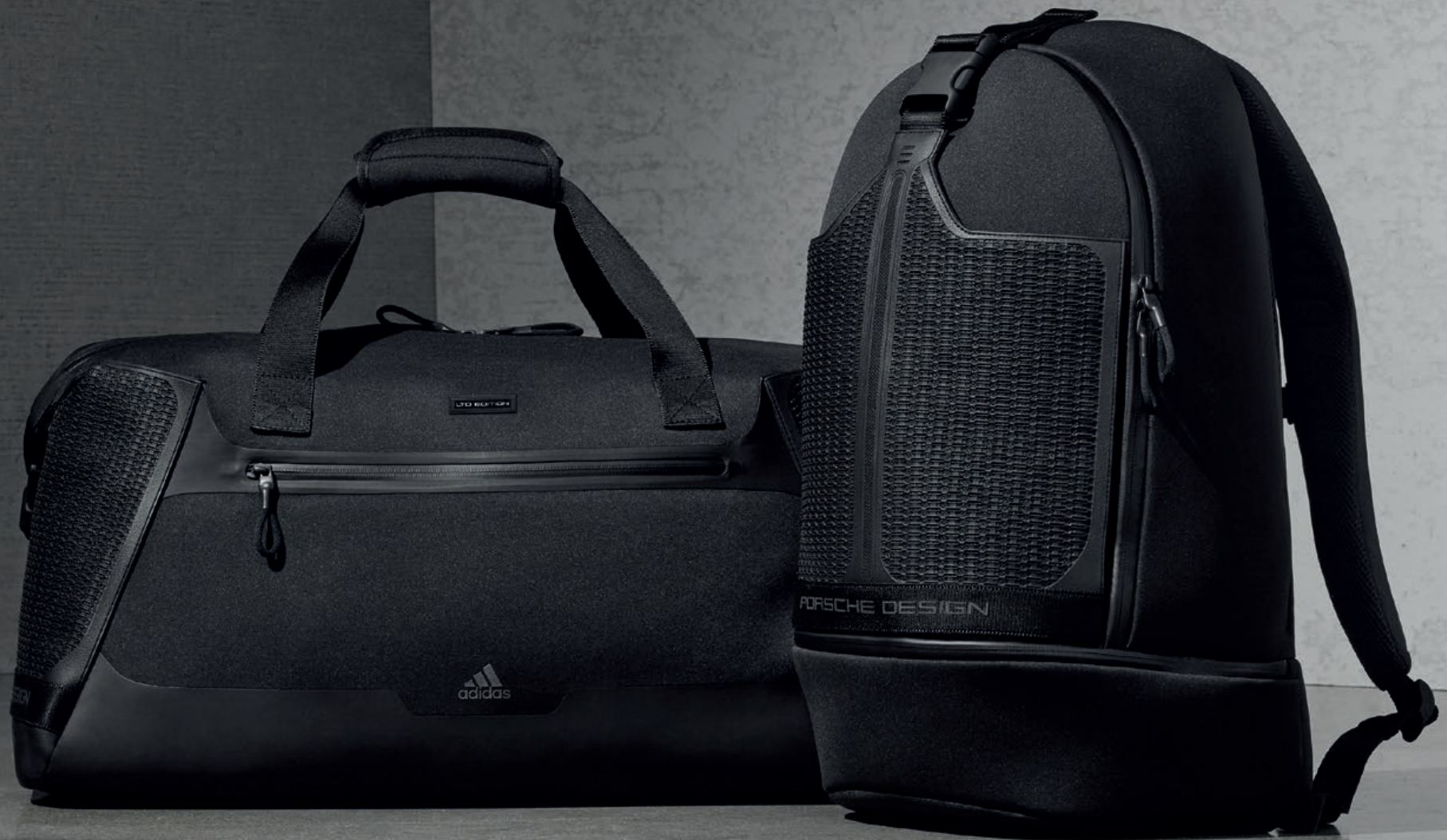
BS TEAMBAG LTD EDITION BS BACKPACK LTD EDITION