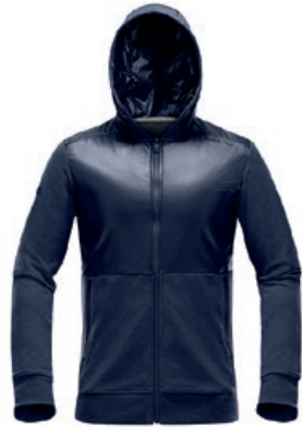
CLASSIC FULLZIP SWEAT HOODIE | BR9364