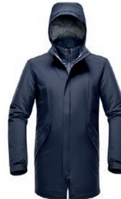
ZIPIN PARKA | BQ5362