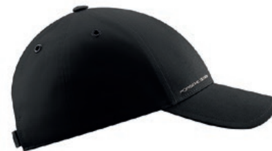
CLASSIC CAP 2 | BR9029