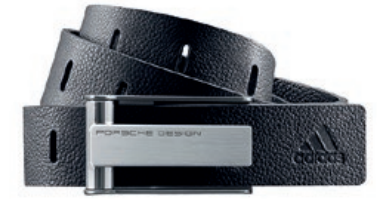
HOOK BELT | AI3680