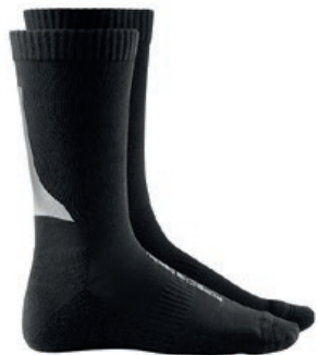
REFLECTIVE CREW SOCKS | BR9077