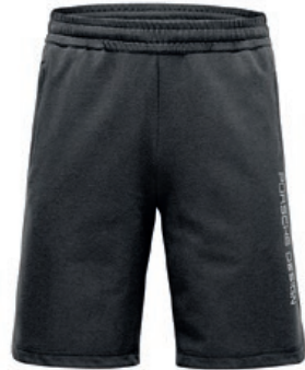
SWEAT SHORTS | BR9360