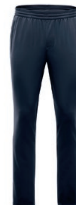
BS PANTS | BR9386