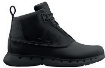
SNOW EASY WINTER 2.0 | S81209