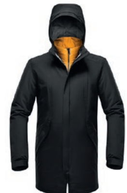
ZIPIN PARKA | BQ5361