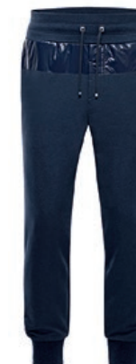
SWEAT PANTS | BR9356