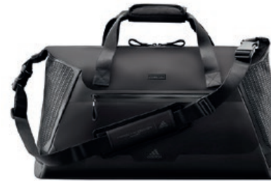
BS TEAMBAG LTD EDITION | BR9038