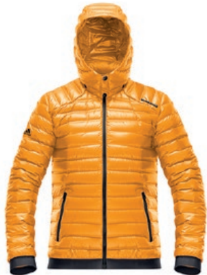
PACKABLE LIGHT DOWN JACKET | BR9444