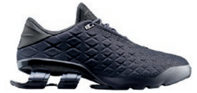
BOUNCE™:S⁴ LUX | S81182