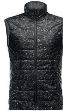
PADDED REFLECTIVE VEST | BR9427