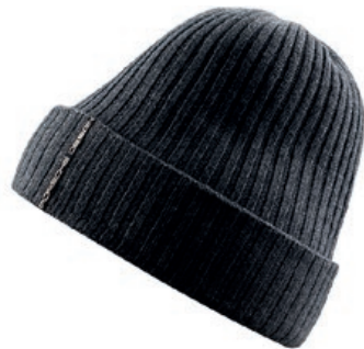
RIBBED WOOLIE | BR9046