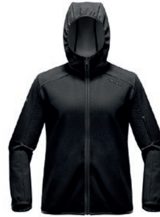
KNITSHELL JACKET | BQ5378