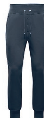
HEAVYWEIGHT TRACK PANTS | BQ5298