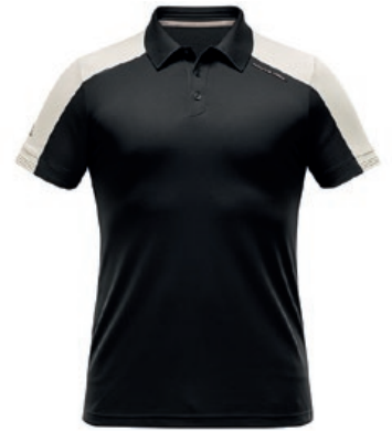
COLORBLOCK PIQUE POLO | BQ9752