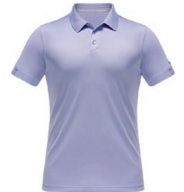
PIQUE POLO SHIRT | BQ5385