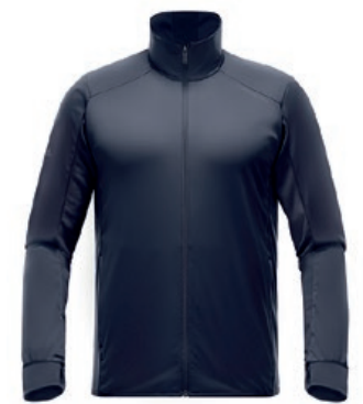
BS JACKET | BR9389