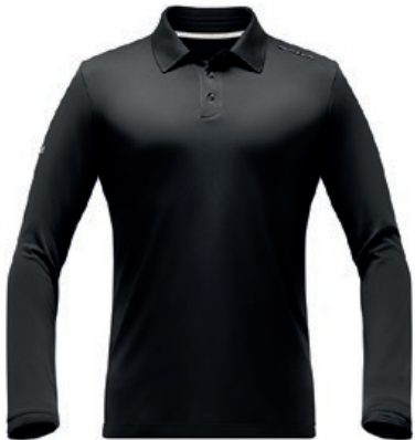
LS PIQUE POLO | S97916