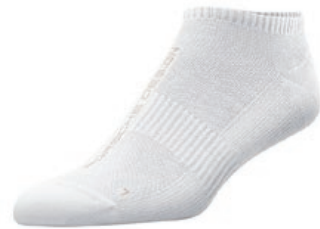
LINER SOCKS | AI3669