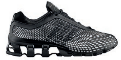
BOUNCE™:S² | S81206