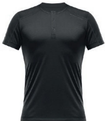
TECH WOOL TEE | BR9414