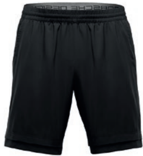
SPA SHORTS | BQ9760