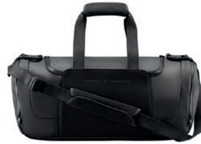
GYM TEAMBAG | BR9036