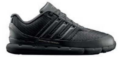
EC RUNNING | S81191