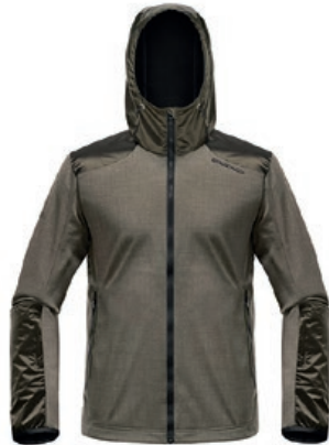
SOFTSHELL JACKET | BQ9703