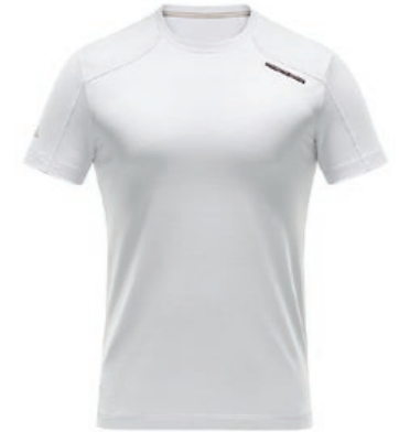
CORE TEE | BQ9745