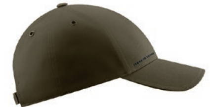
CLASSIC CAP 2 | BR9028