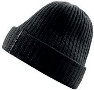
RIBBED WOOLIE | BR9045