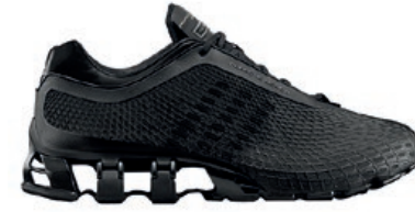
BOUNCE™:S² | S81205