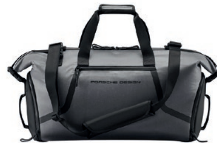
OT TEAMBAG | BR9041