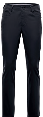
FUNCTIONAL PANTS | AX6031