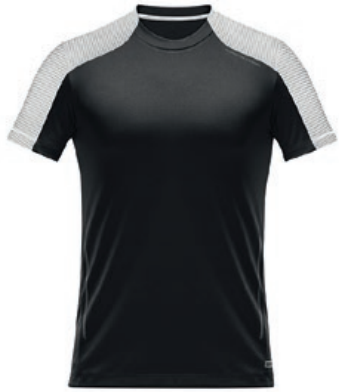
BS TEE | BR9370