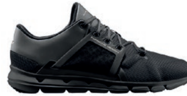
EASY TRAINER 5 | S81187