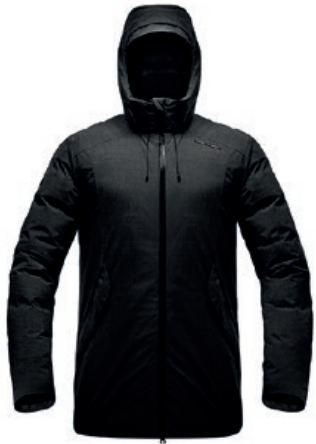
CASUAL DOWN COAT | BR9446