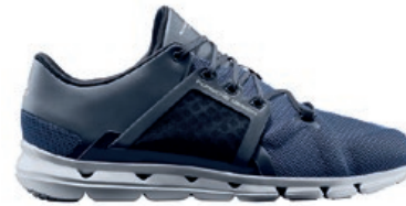
EASY TRAINER 5 | S81188