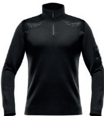
KNIT JUMPER | BR9347