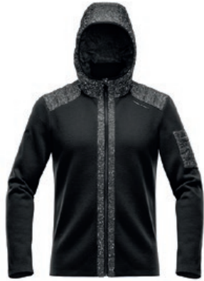
TECHNICAL KNIT JACKET | BR9556