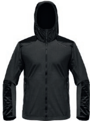
SOFTSHELL JACKET | BQ9702