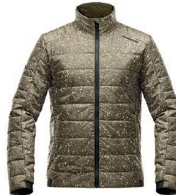
PADDED REFLECTIVE JACKET | BR9438