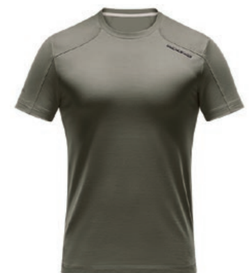
CORE TEE | BQ9739