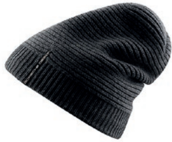
WINTER BEANIE | BR9024