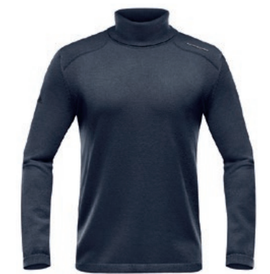
CLASSY ROLLNECK | BR9405