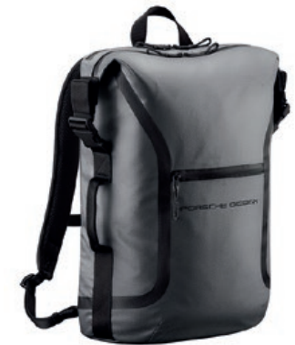
OT BACKPACK | BR9044