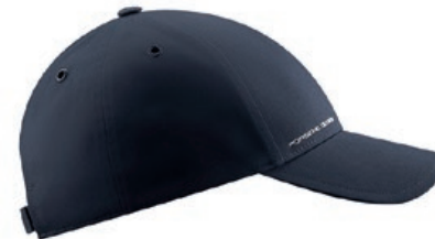
CLASSIC CAP 2 | BR9026