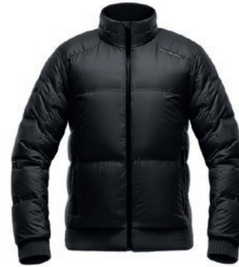
BONDED DOWN JACKET | BQ5357