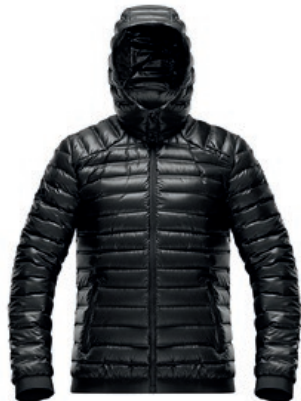
PACKABLE LIGHT DOWN JACKET | BR9439