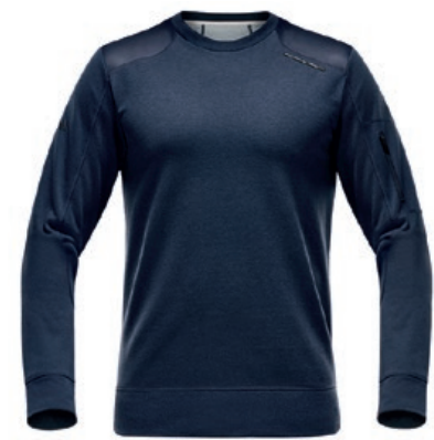
CREW SWEAT TOP | BR9369