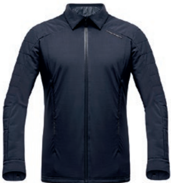
PADDED COMMUTER JACKET | BR9420