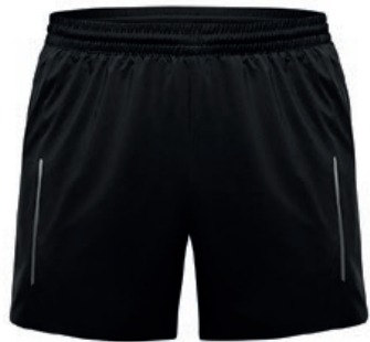
BS SHORTS | BR9380