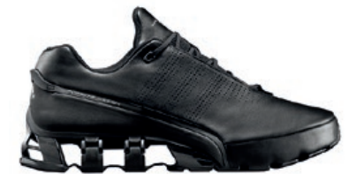
BOUNCE™:SL | S81208