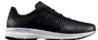
ENDURANCE 2.0 | S81193