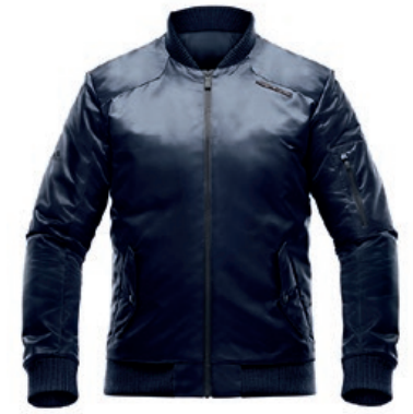
BOMBER JACKET | BR9452