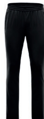
BS PANTS | BR9383