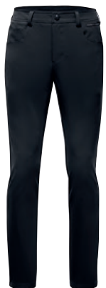
TRAVEL PANTS | AX5988