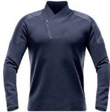
HIGH COLLAR KNIT TOP | BR9408