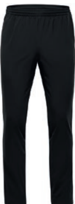
TRAINING PANTS | BQ9754