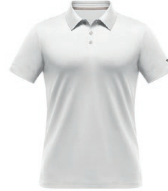
PIQUE POLO SHIRT | AI1597