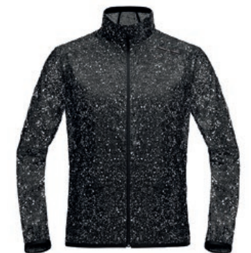
REFLECTIVE LIGHT JACKET | BR9453