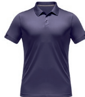
PIQUE POLO SHIRT | BQ5386