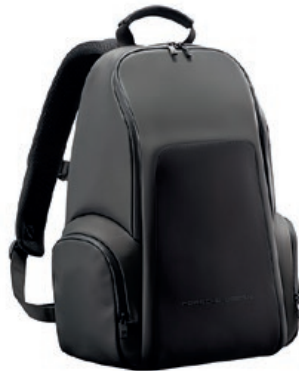
GYM BACKPACK | BR9037