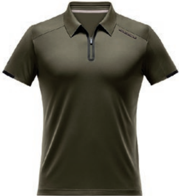
TRAVEL POLO | BQ9749