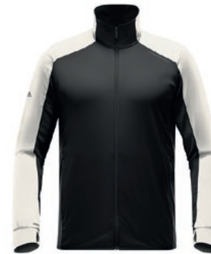
BS JACKET | BR9387