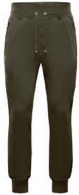
HEAVYWEIGHT TRACK PANTS | BQ5291