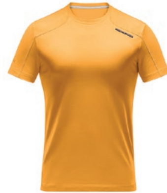
CORE TEE | BQ9740