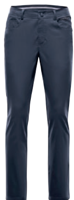
FUNCTIONAL PANTS | BQ9717