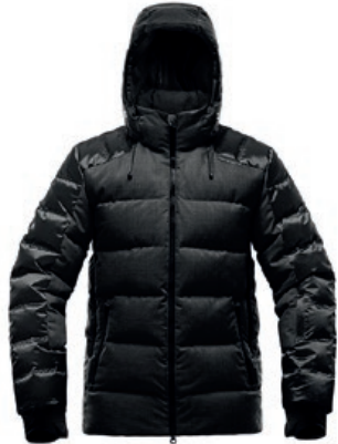
FUNCTIONAL DOWN JACKET | BR9392