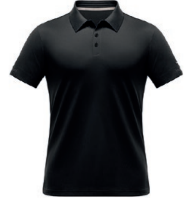
PIQUE POLO SHIRT | AI1600