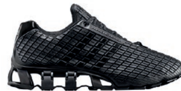
BOUNCE™:S³ | S81207