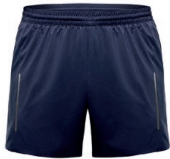
BS SHORTS | BR9381