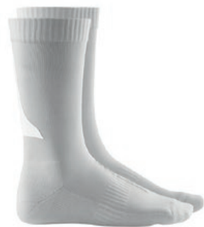
REFLECTIVE CREW SOCKS | BR9075