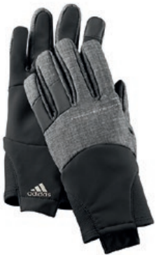
CLIMA GLOVES | BR9048