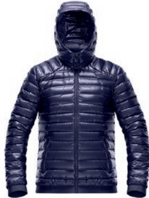
PACKABLE LIGHT DOWN JACKET | BR9441