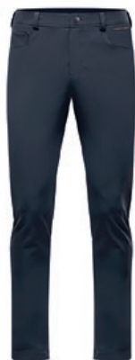
TRAVEL PANTS | BQ9725