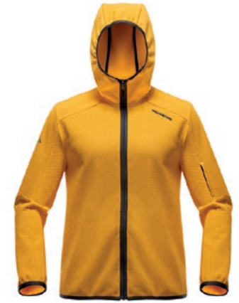
KNITSHELL JACKET | BQ5379