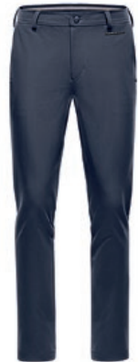
FAIRWAY PANTS | BQ9723