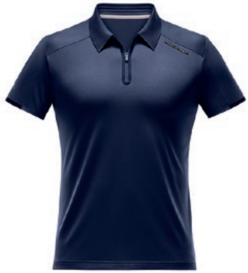
TRAVEL POLO | BQ9749