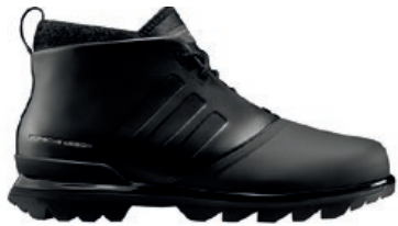
INTERMEDIATE 2.0 | S81195