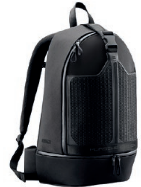
BS BACKPACK LTD EDITION | BR9040