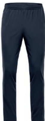
TRAINING PANTS | BQ9756