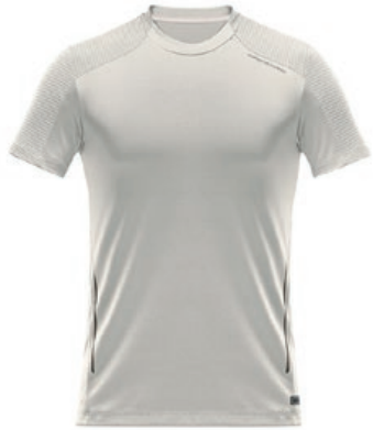
BS TEE | BR9375