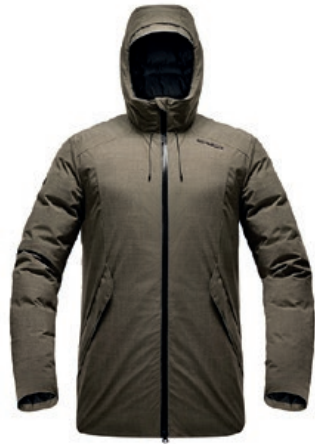
CASUAL DOWN COAT | BR9447