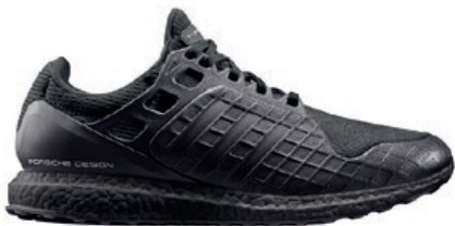
ULTRABOOST TRAINER | S81203