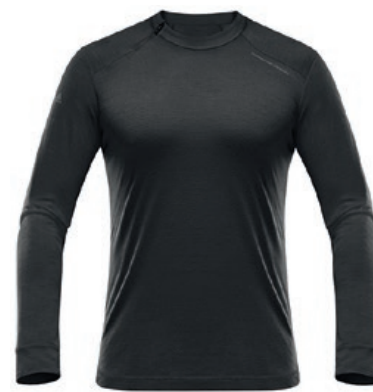
TECH WOOL LONG SLEEVE TEE | BR9411