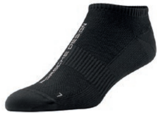
LINER SOCKS | AI3668