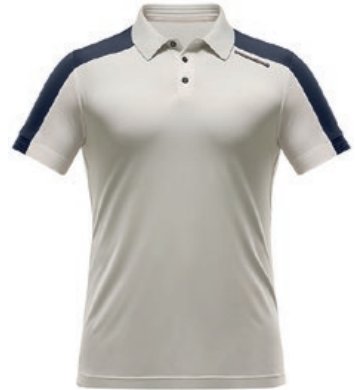
COLORBLOCK PIQUE POLO | BQ9753