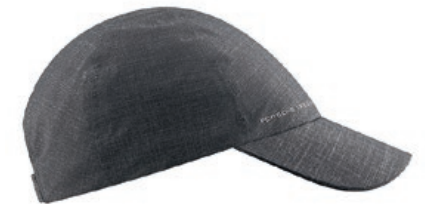
FUNCTIONAL CAP | BR9078