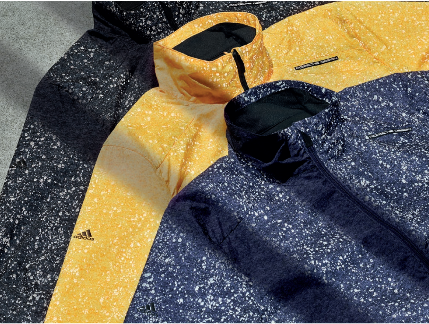
REFLECTIVE LIGHT JACKET BR9453 REFLECTIVE LIGHT JACKET BR9458 REFLECTIVE LIGHT JACKET BR9457