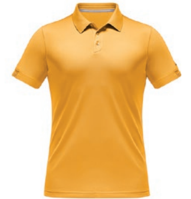
PIQUE POLO SHIRT | BQ5382