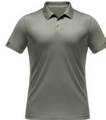
PIQUE POLO SHIRT | BQ5381