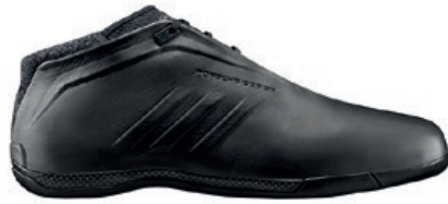
ATHLETIC LEATHER MID | S81177