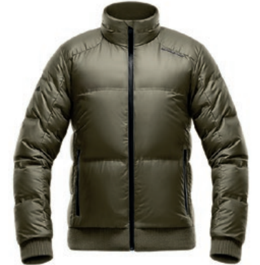
BONDED DOWN JACKET | BQ5358