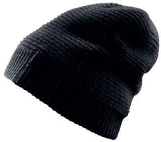
WINTER BEANIE | AX5477