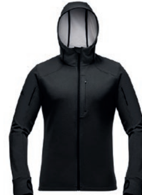
TRAINING HOODIE | BQ5375