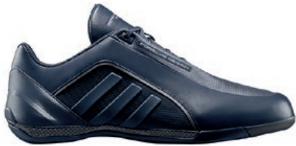
ATHLETIC MESH 3 | S81179