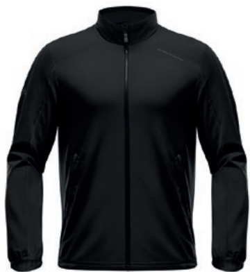
TRAINING JACKET | BQ9710