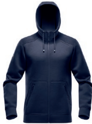
HEAVYWEIGHT HOODIE | BQ9766