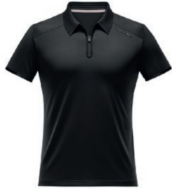
TRAVEL POLO | BQ9746