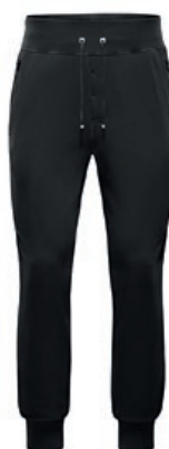
HEAVYWEIGHT TRACK PANTS | BQ5284