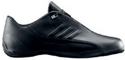
ATHLETIC LEATHER 4 | BB5520