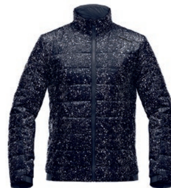
PADDED REFLECTIVE JACKET | BR9435