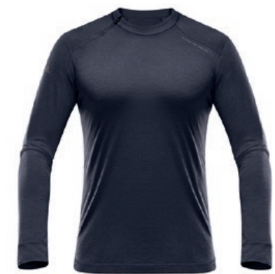
TECH WOOL LONG SLEEVE TEE | BR9413