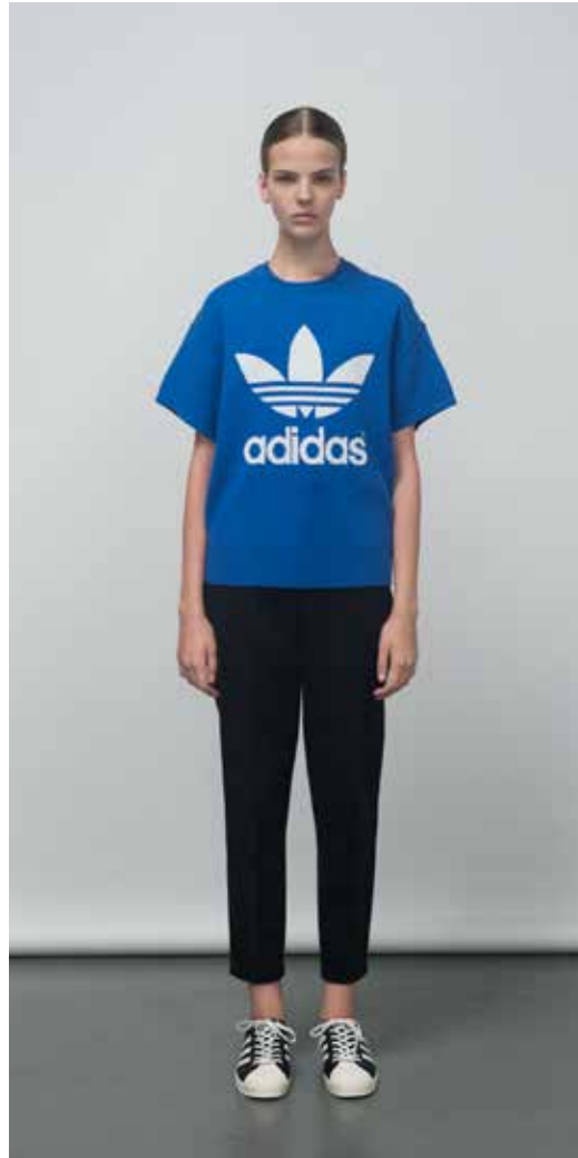
8 HY SSL KNIT S15247 HY TRACK PANT S15256 AOH002 B35757