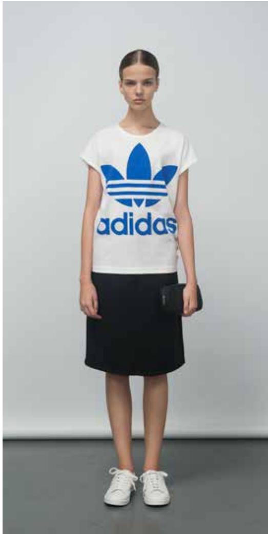
7 HY TREFOIL TEE S15238 HY SKIRT S15257 HYKE CLUTCH BLACK S20263 AOH001 B26101