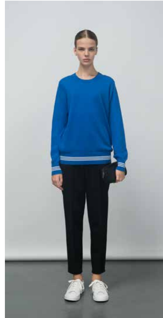
9 HY LSL KNIT S15253 HY TRACK PANT S15256 HYKE CLUTCH BLACK S20263 AOH001 B26101