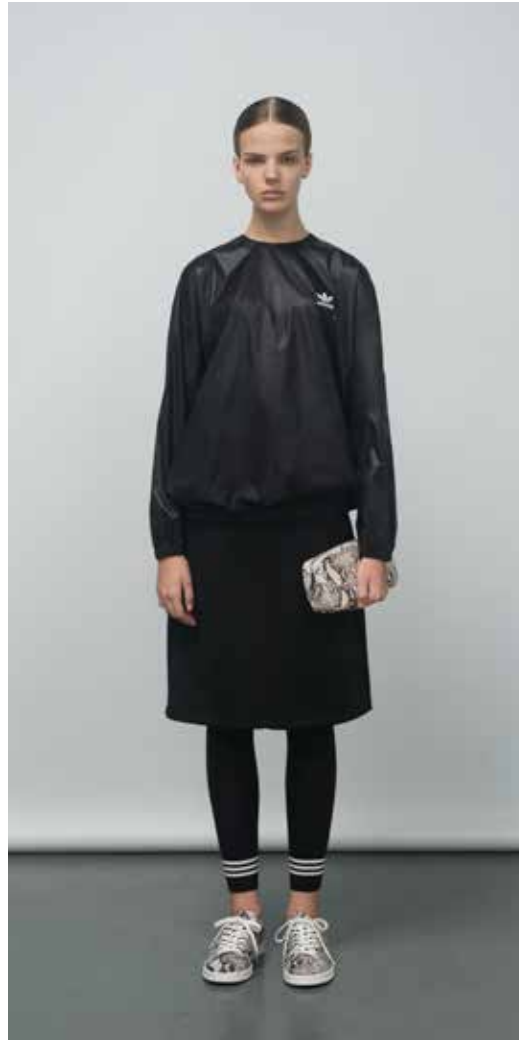
5 HY WIND PULLOVER S15254 HY SKIRT S15257 HYKE LEGGINGS S24871 HYKE CLUTCH PYTHON S20264 AOH001_PYTHON B26098