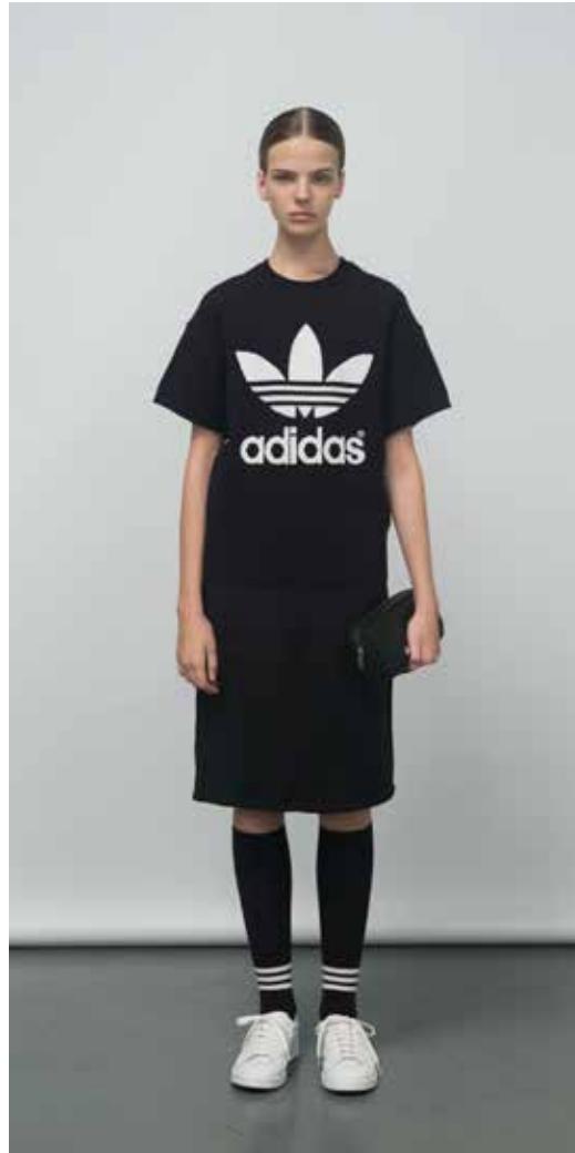
2 HY SSL KNIT S15246 HY SKIRT S15257 HYKE KNEE SOCK S20265 HYKE CLUTCH BLACK S20263 AOH001 B26101