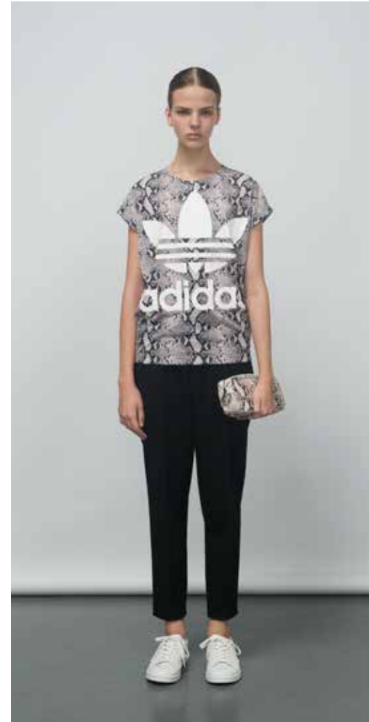
6 HY TREFOIL T PY S15243 HY TRACK PANT S15256 HYKE CLUTCH PYTHON S20264 AOH001 B26101