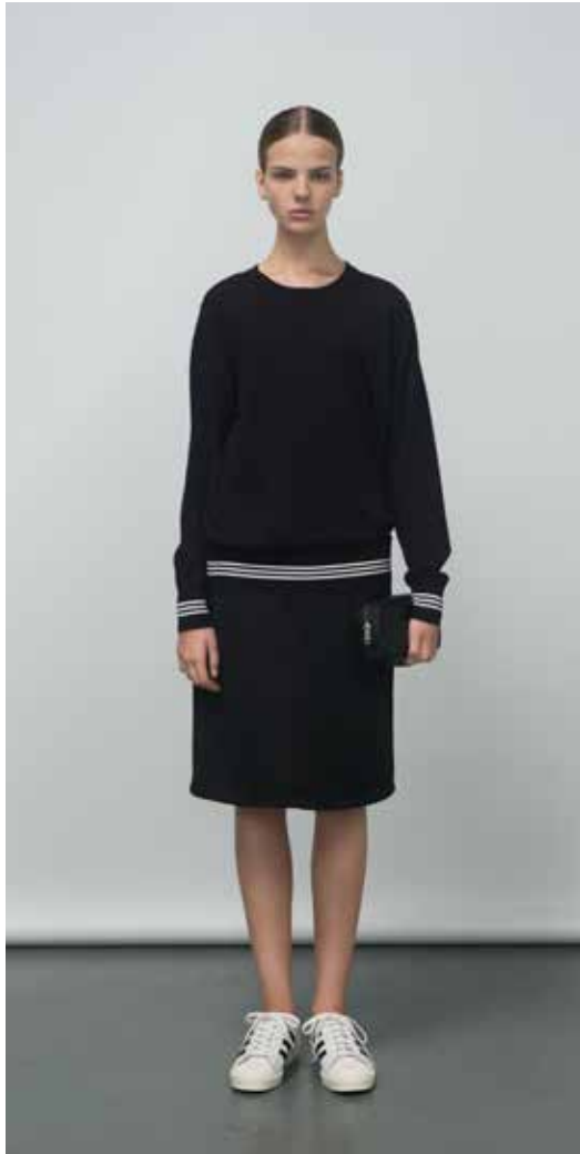
4 HY LSL KNIT S15252 HY SKIRT S15257 HYKE CLUTCH BLACK S20263 AOH002 B35756