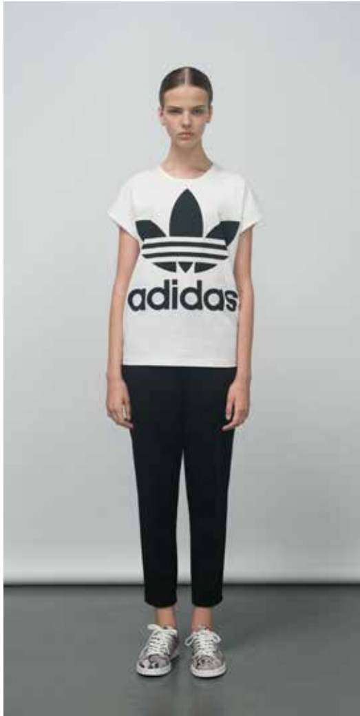
1 HY TREFOIL TEE S15237 HY TRACK PANT S15256 AOH001_PYTHON B26098