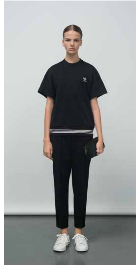
3 HY SSL PULLOVER S15255 HY TRACK PANT S15256 HYKE CLUTCH BLACK S20263 AOH001 B26101