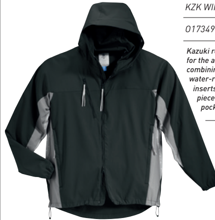
KZK WIND JKT