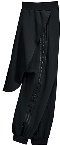
TAILS SWEAT PANT