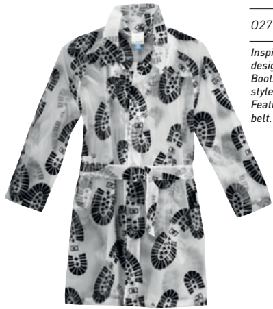
BOOTS STOMP RAIN COAT