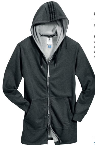
KZK LONG HOODIE