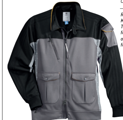
KZK TRACK TOP