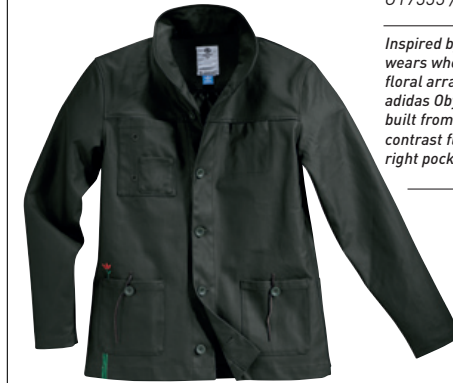
PLANTS WORK JKT