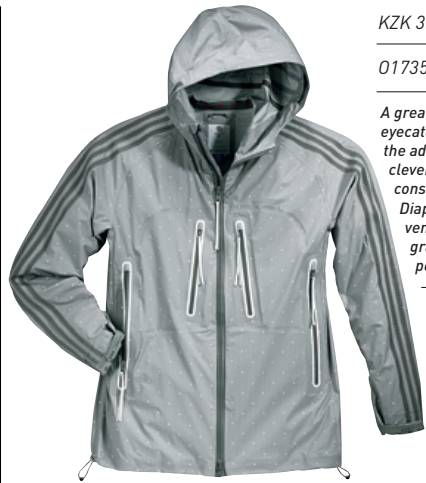
KZK 3L SHELL JKT