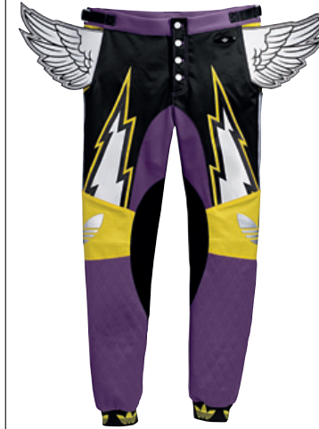
WINGS MOTO PANTS