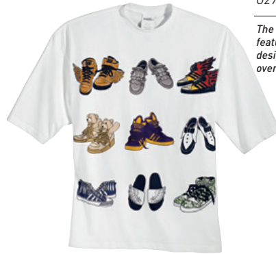
SHOE GRAPHICS BIG TEE