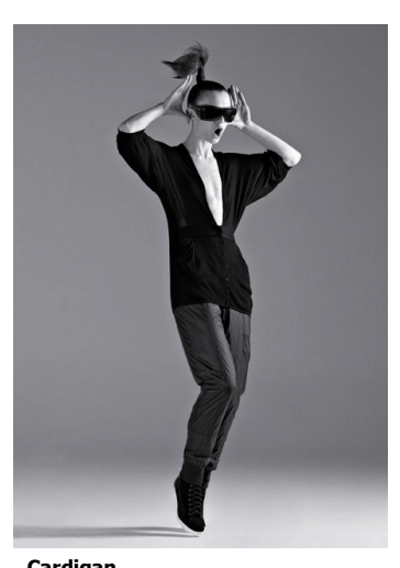
Cardigan 554018_01 Utility Pants Shine 554520_01 Urban Motus Wn's Hi 349347_01