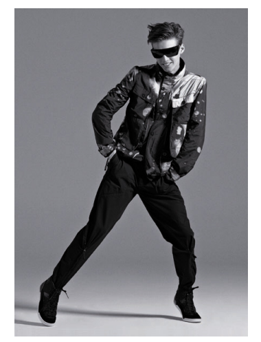
Exclusive Jacket – Oil Print 555135_01 Utility Pants 554006_01 Urban Flyer Mn's 350636_01