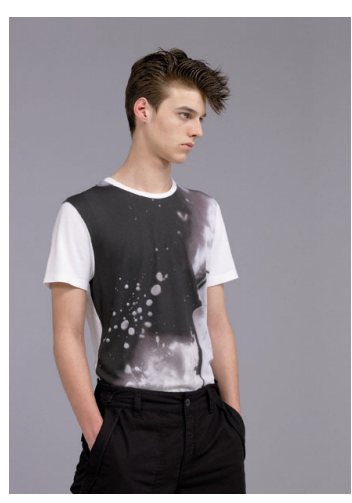
Exclusive Photo Print Tee 553990_02 Utility Pants 554006_01

'Urban Mobility is a carefully studied hybrid collection between style and high-tech function encompassing all our needs in an urban environment. This collection is a considered balance between PUMA's technical excellence and my narrative approach to design' Hussein Chalayan