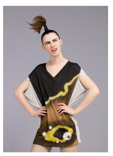
Graphic Tee 554014_02