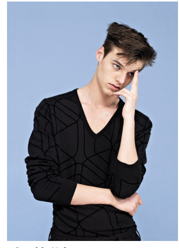
Graphic Knit 554731_01 Utility Pants 554006_01