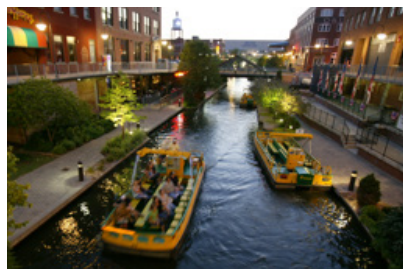
Oklahoma City has redesigned public spaces to make them more walkable.