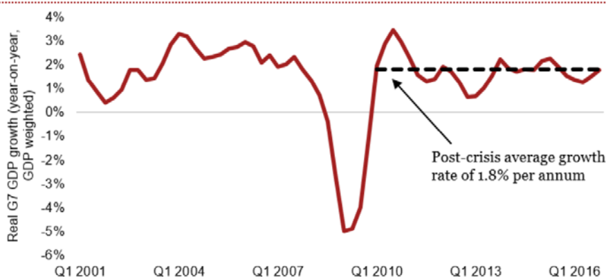
Fig 1: Recently there has been a gradual uptick in G7 economic activity