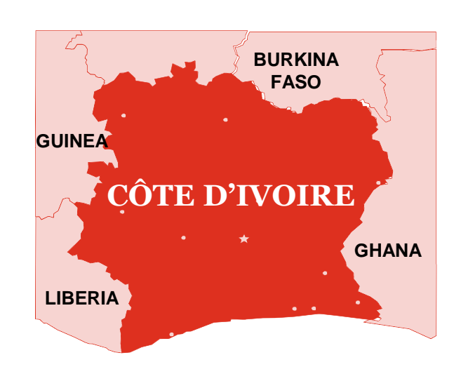
Cocoa Production in 2012 (Metric Tons)