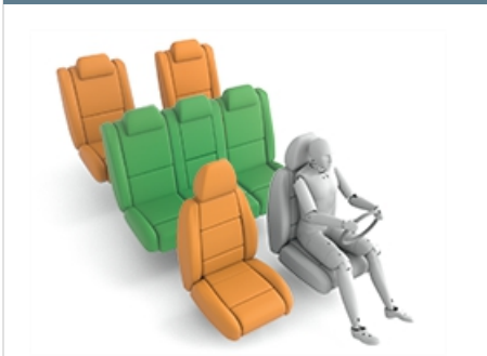
Maxi Cosi Cabriofix (Belt)