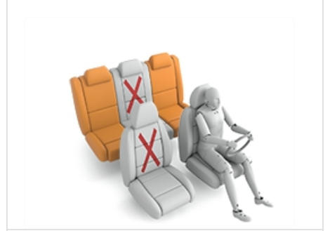
Römer Duo Plus (ISOFIX)