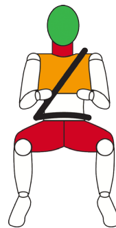
FRONTAL 6.0 pts (of 16)