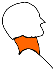
Rear Impact (Whiplash)