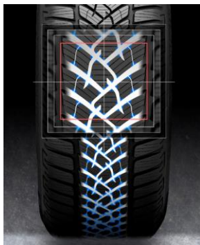
SNOW CATCHER TECHNOLOGY

The Kristall Control HP2 uses “Snow Catcher Technology”, which works according to the principle that nothing sticks to snow better than snow itself. Profile grooves are arranged closely together to ensure that the snow stays within the tread profile and is heavily compressed. Overall, this leads to improved traction on snow.