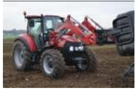
Farmall U Pro

The three new Maxxum CVX EP tractors are the first four-cylinder Case IH models to incorporate this novel transmission. Versatile and cost-effective, the Maxxum 110 CVX EP, Maxxum 120 CVX EP and Maxxum 130 CVX EP are rated at 110hp, 121hp and 131hp, but with 'Power Management' deliver up to 32hp more during transport, hydraulic and PTO applications.