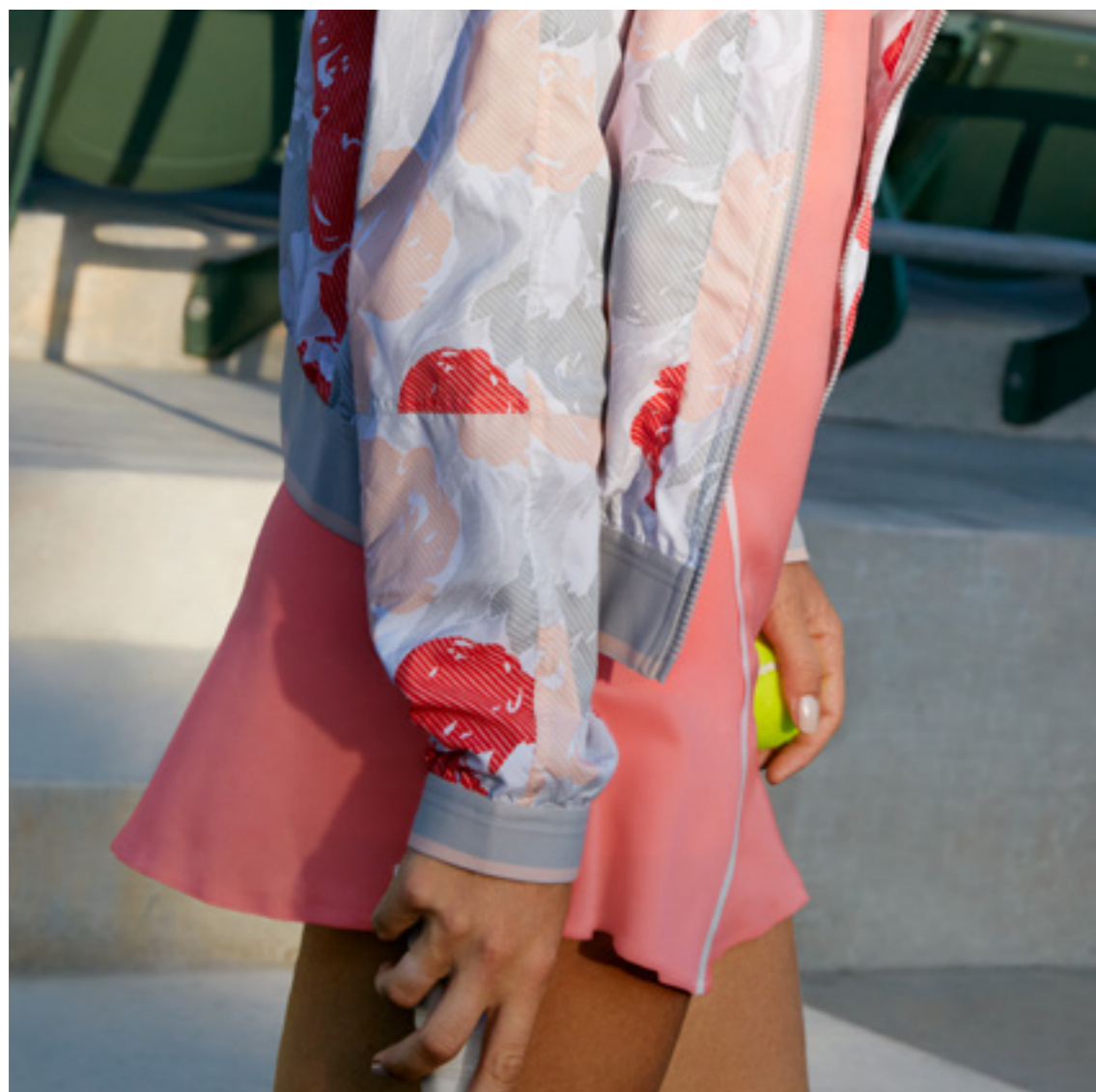
AI0703 Dress Australia / AI3828 Jacket Lipstick