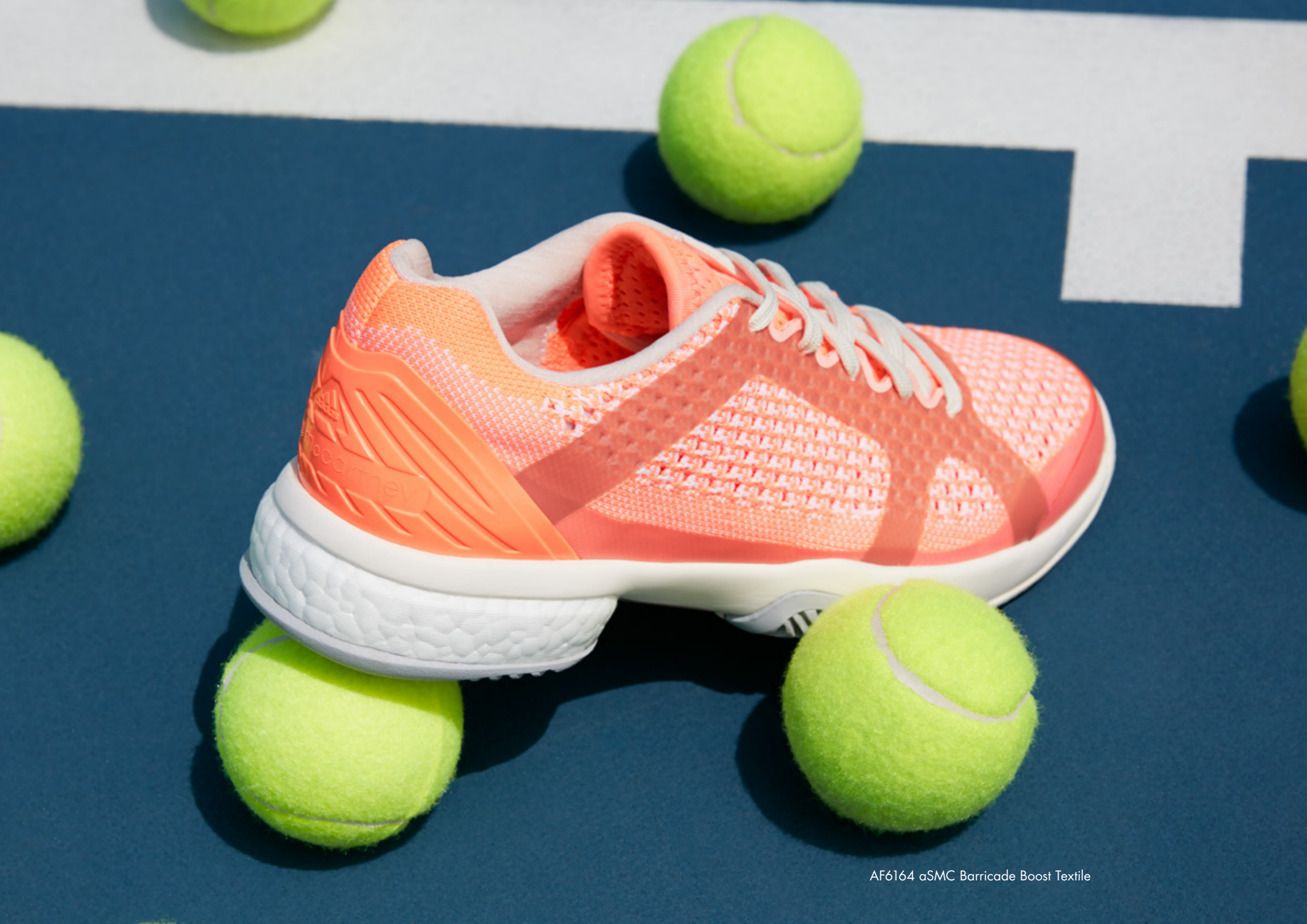
AF6164 aSMC Barricade Boost Textile