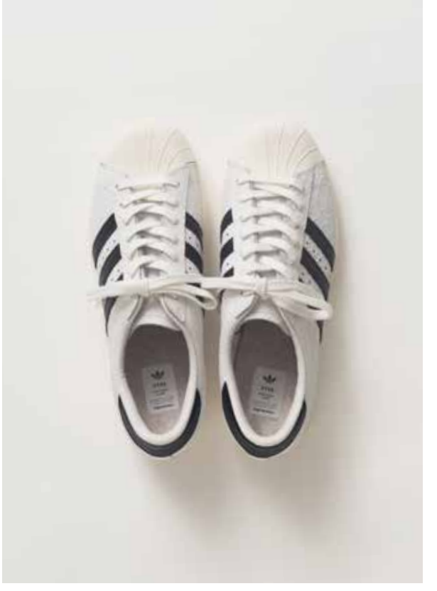
AOH-002 ARTICLE NO. B35756 COLOR ftwr white / core black / chalk white