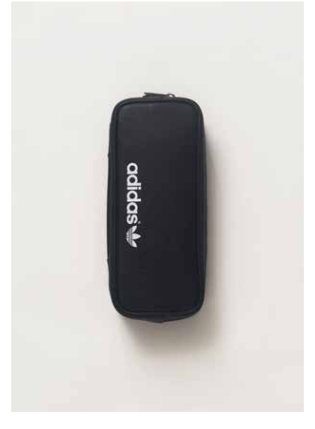
HYKE CLUTCH BLACK ARTICLE S14AOHYKE100 MAIN MAT

ARTICLE NO. / COLOR S20263 / black MAIN MATERIAL 100% polyurethane