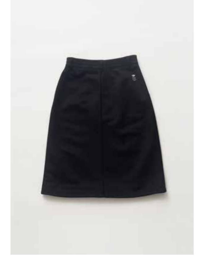
HY SKIRT S15HYKE008

A merger between the Adidas Original Track Pants and Slacks. Same material as the Track Pants. Bonding processing.