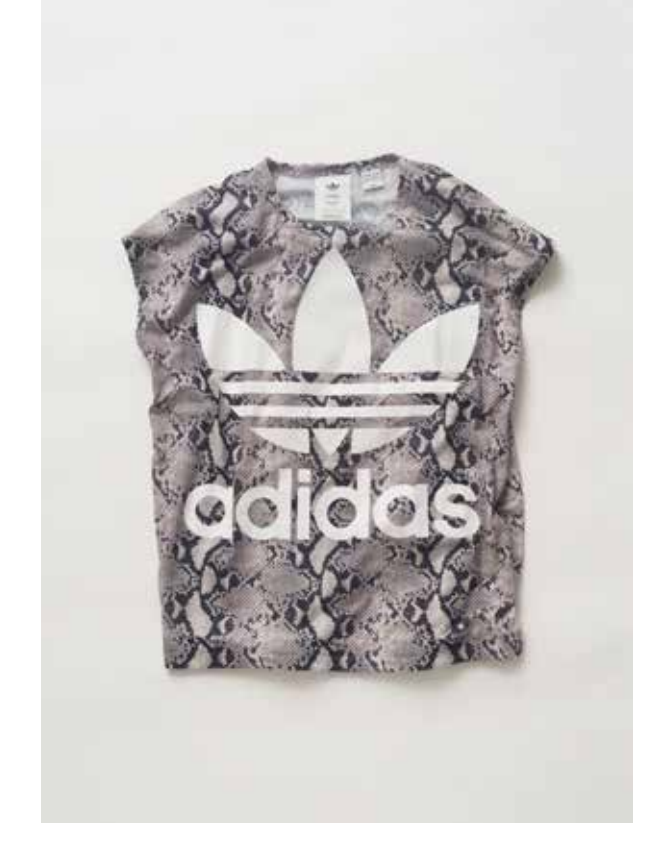
HY TREFOIL TEE PY S15HYKE002