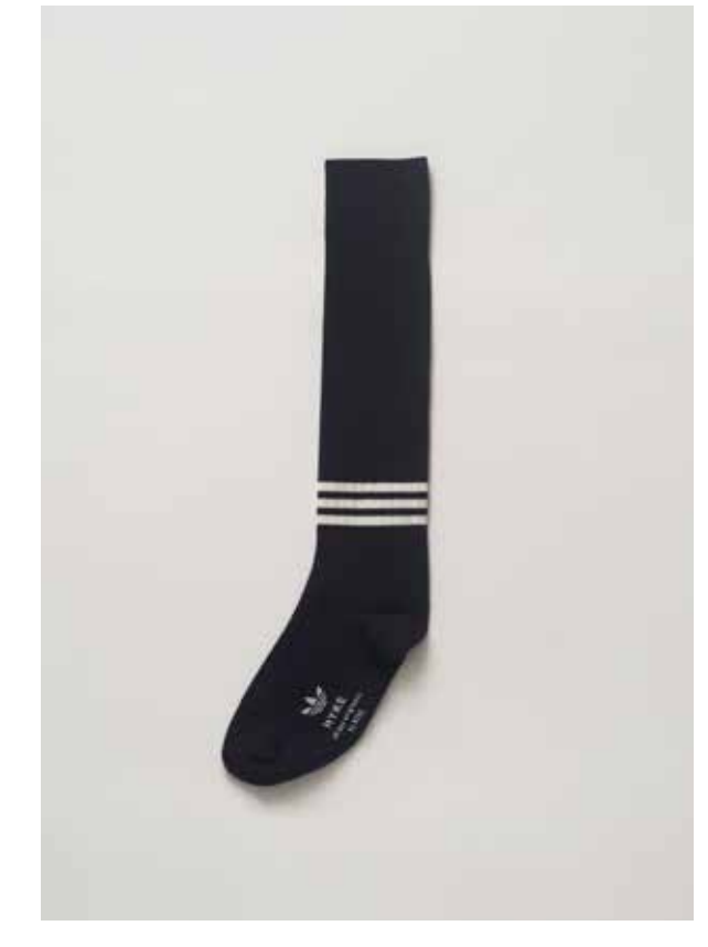
HY LSL KNIT S15HYKE004