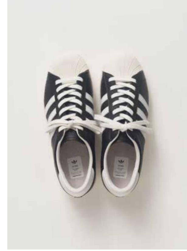
AOH-002 ARTICLE NO. B35757 COLOR supplier colour / supplier colour / chalk white