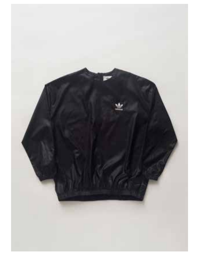
HY SSL KNIT S15HYKE003