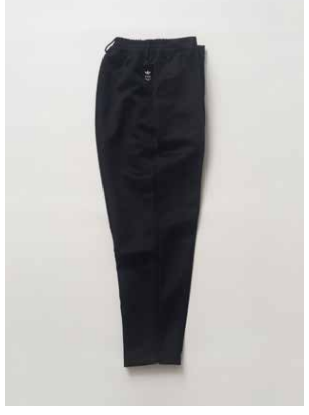
HY TRACK PANT S15HYKE007

A zipper in the back, in the neck area. A pullover. Characterized by the tense feel created by bonding processing.